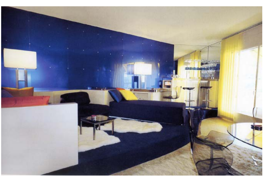
Archival image. Private commission, Cannes

Marc du Plantier Pair of Lamps, 1970 Plexiglass, enameled metal 84 x 54 x 30cm 33.07 x 21.26 x 11.81 inches Designed for private commission, Cannes