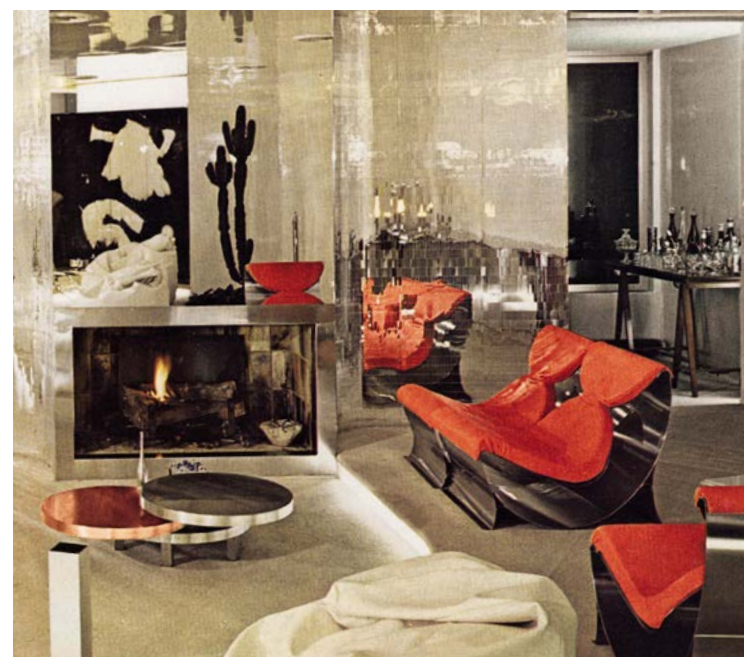
Archival image. Apartment of François Perier, Paris.