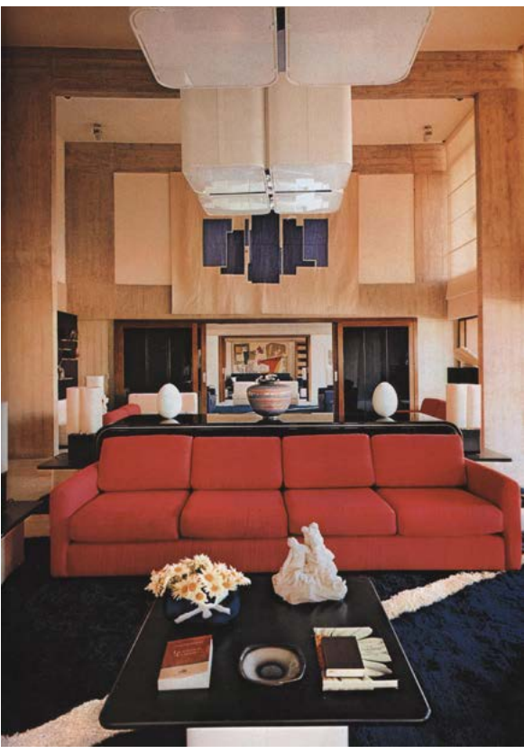
Archival image. Residence of the French ambassador to Brazil, reception room, 1975