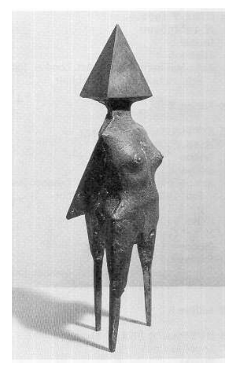
Lynn Chadwick Girl IV, 1971 Bronze. 31.8 cm; 12.5 inches Edition 1 of 6 Stamped "Chadwick 71 633"