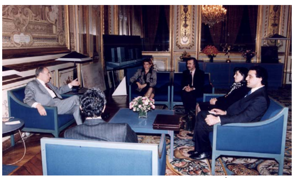
Palais de Élysée, Paris, France.

Pierre Paulin Pair of Armchairs, 1984 Lacquered wood, foam, original fabric 32.28 x 29.13 x 32.28inches 82 x 74 x 82cm seat height: 19.3 inches (49 cm) Designed for the office of President François Mitterand at the Palais de l'Élysée. Manufactured by Ségransan for the Mobilier National.