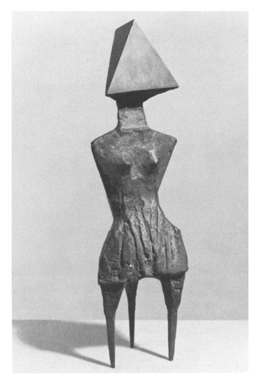
Lynn Chadwick Girl II , 1971 Bronze. 39.5 cm; 15.5 inches Edition 1 of 6 Stamped "Chadwick 71 628"