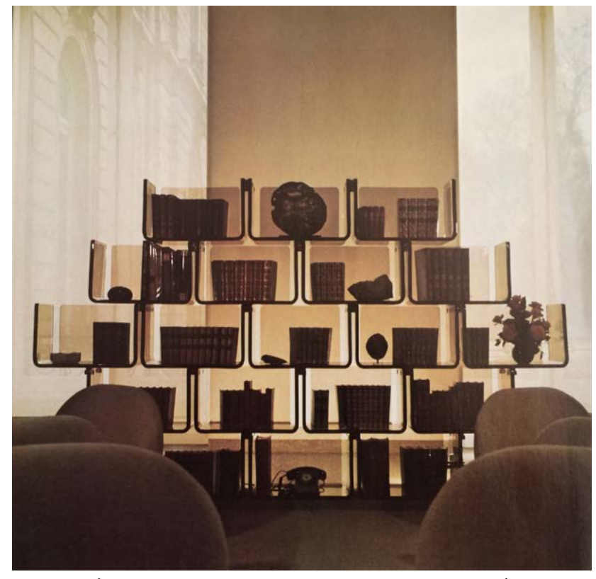
View of the Élysée Bookcase in the Smoking Room at the Palais de l'Élysée, 1972.

Pierre Paulin Élysée Bookcase, 1971 Smoked Altuglas, steel, wengé base 60.24 x 68.5 x 14.57inches 153 x 174 x 37cm Signed 'Paul'