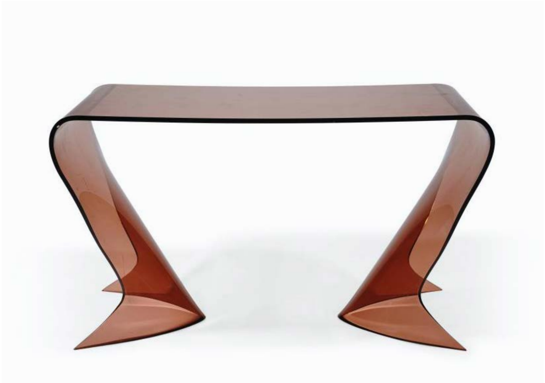
Francois Arnal - Atelier A Elice Console , 1968 Smoked Plexiglas 27.17 x 48.43 x 23.62inches 69 x 123 x 60cm For Atelier A