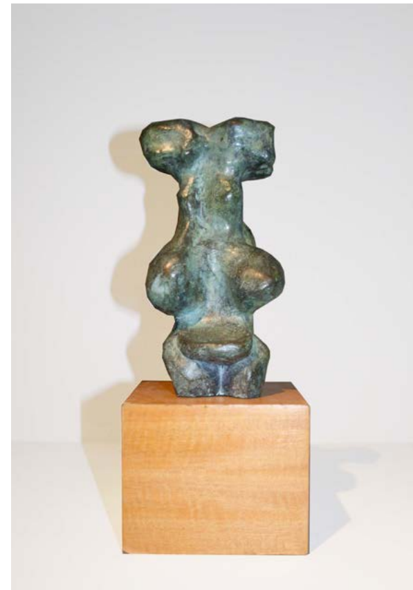
François Stahly Terre d'abondance, c.1970 Bronze 10 x 5 x 5 inches 25.4 x 12.7 x 12.7cm Signed