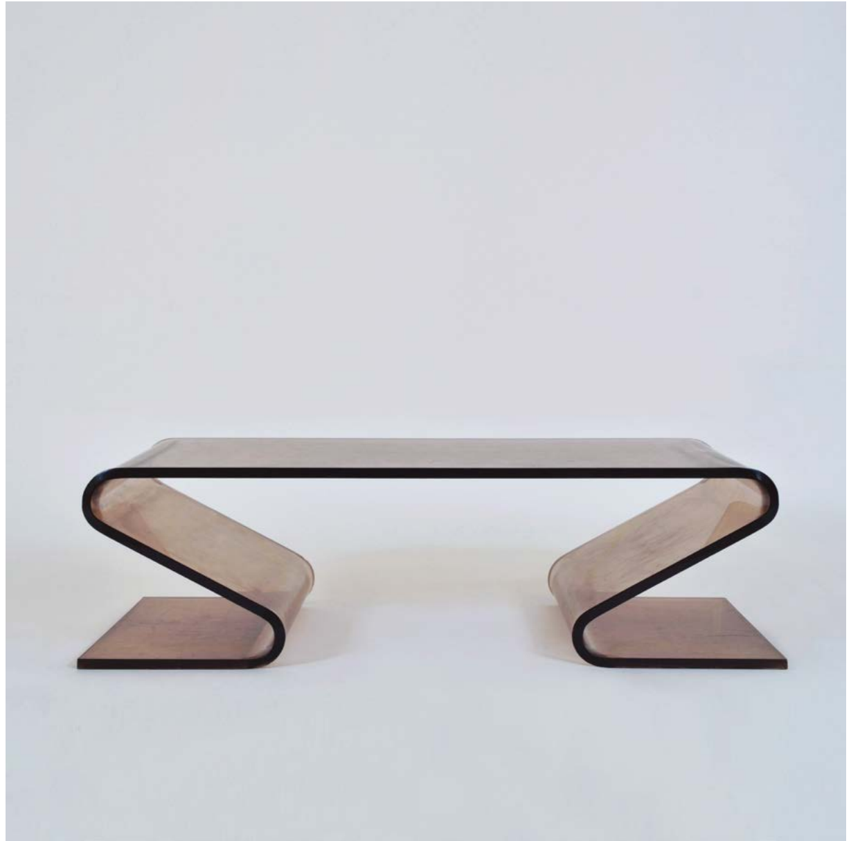
Atelier A - Francois Arnal Z Table , 1970 c. Plexiglas 15 x 50 x 19.5inches 38 x 127 x 49.5cm