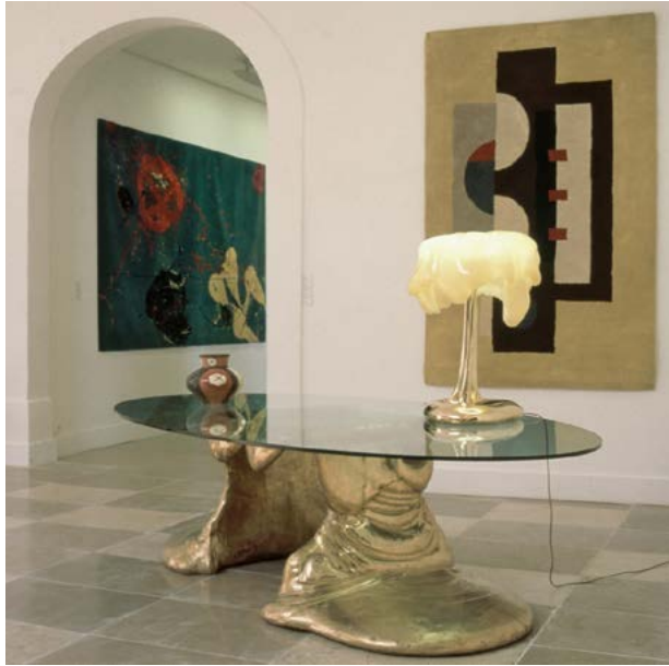
Installation view: Objets d'artistes, Galerie Beaubourg, Vence, France, 2000.