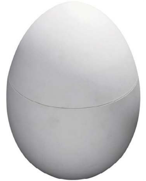
Francois Xavier Lalanne Pair of Grains de Café Chairs, 1984 c. Leather, steel 32.28 x 15.35 x 15.35 inches 82 x 39 x 39 cm Marked CL 84