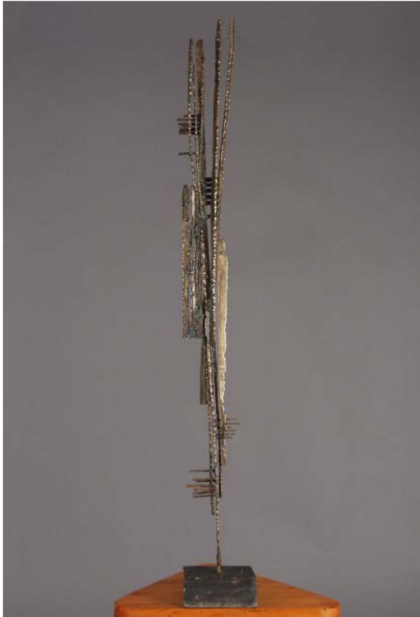
Alain Douillard Sculpture, c.1970 Metal 48 x 5.5 x 4 inches 121.9 x 14 x 10.2cm