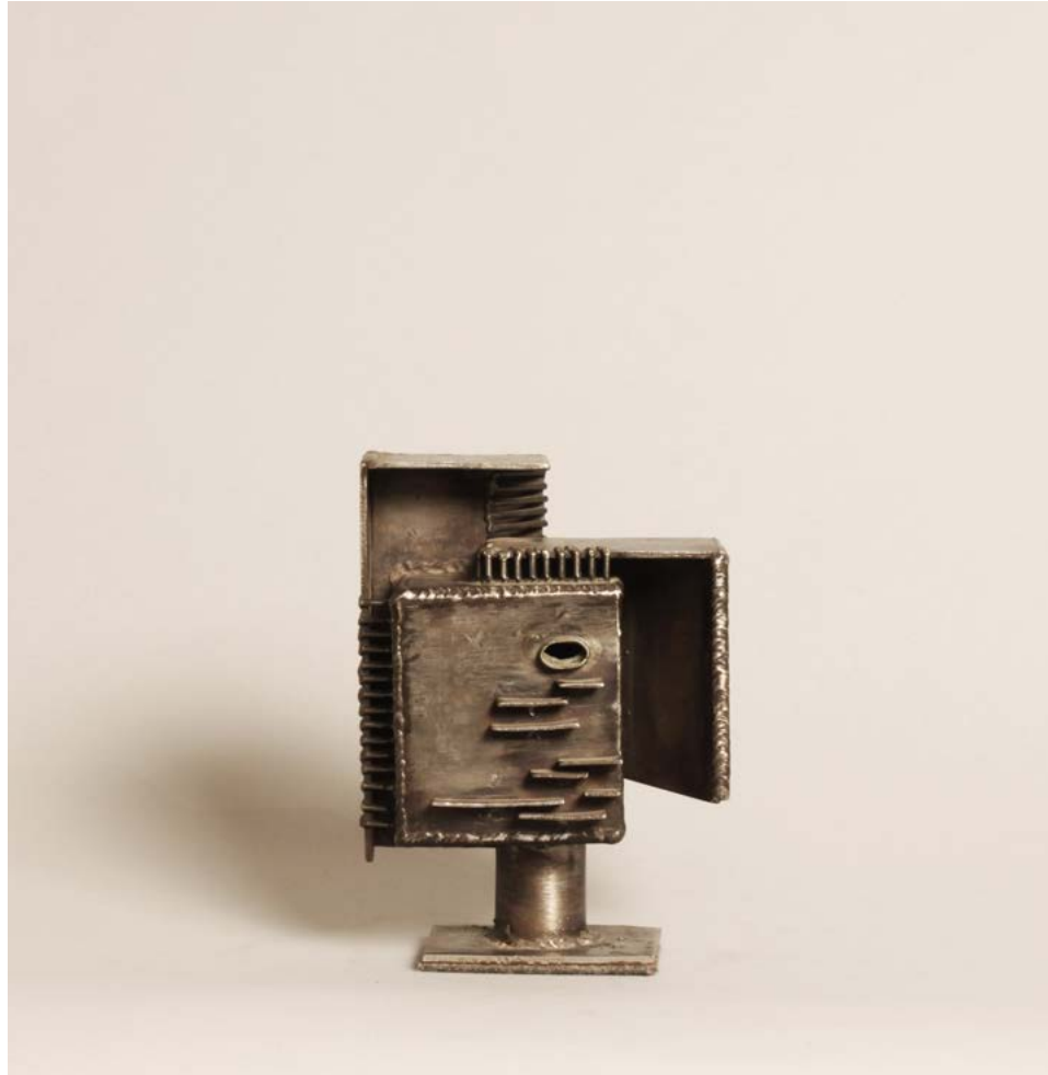
Alain Douillard Sculpture, c.1970 Metal 12.4 x 4 x 3.5inches 31.5 x 10.2 x 8.9cm