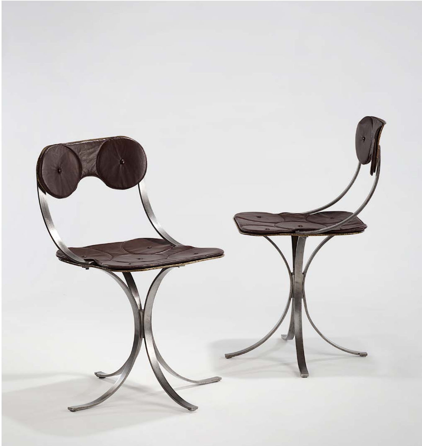
Francois and Claude Lalanne Pair of Grains de Café Chairs, 1984 c. Leather, steel 32.28 x 15.35 x 15.35 inches 82 x 39 x 39 cm Marked CL 84