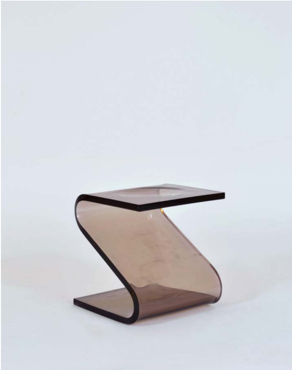
Atelier A - Francois Arnal Z Stool , 1970 c. Plexiglas 15 x 15 x 19.5inches 38.1 x 38.1 x 49.5cm 3 available