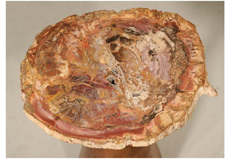
Philippe Hiquily Side Table , 1990 Petrified wood, ceramic 22.83 x 12.99 inches 58 x 33cm