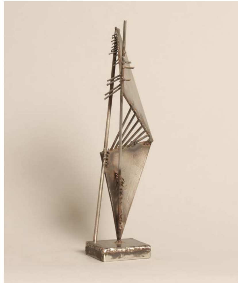
Alain Douillard Sculpture, c.1970 Metal 15 x 3.25 x 2inches 38.1 x 8.3 x 5.1cm