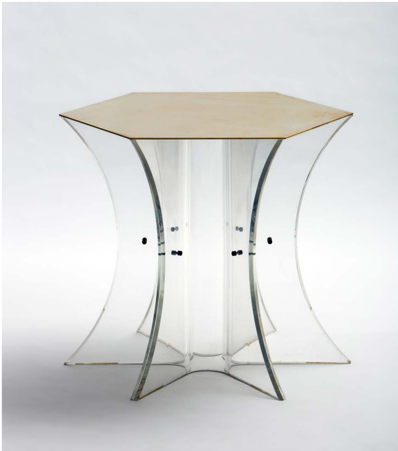
Atelier A / Franois Arnal Gueridon , c. 1969 Plexiglas, brass 25.75 H x 25.5 x 29.5 inches 65.4 H x 64.8 x 74.9 cm Commissioned by Henri Samuel