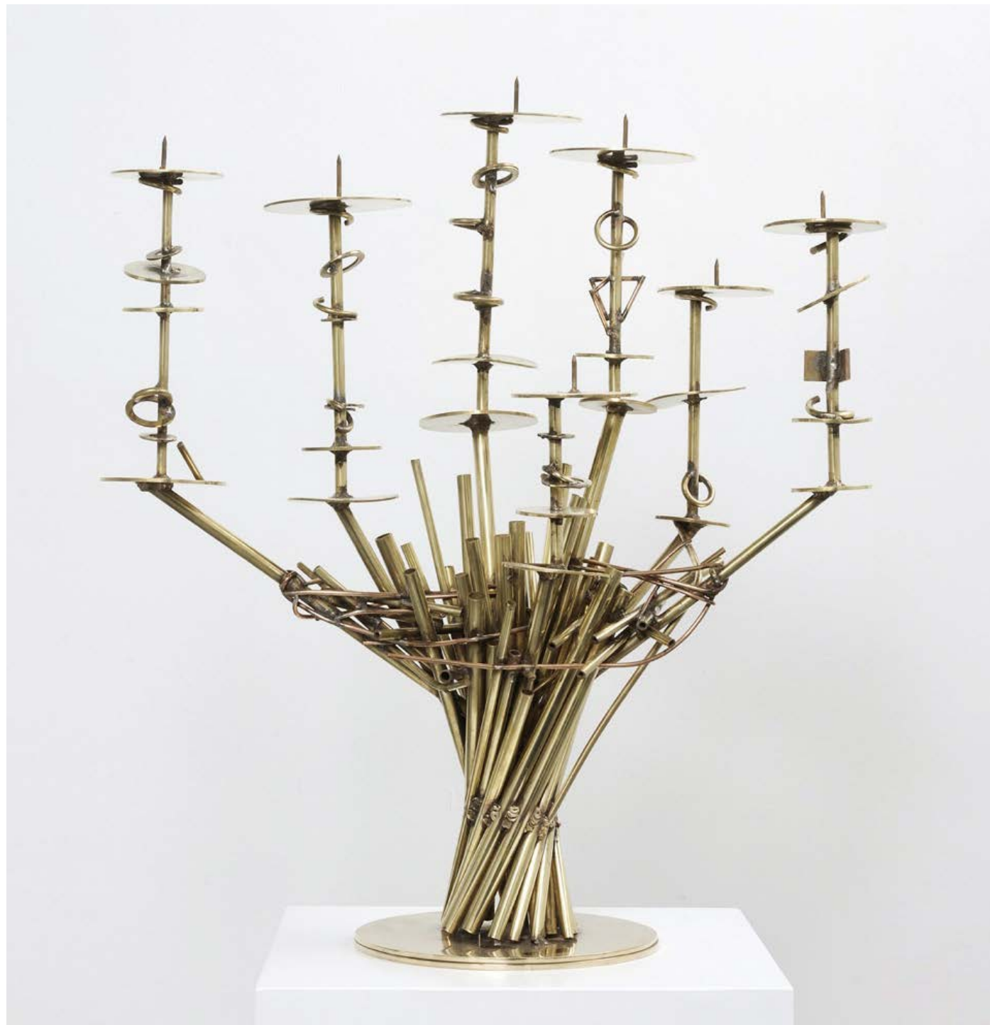
César Pair of Candelabras, 1997/2011 Welded bronze with gold patina 24 x 27 x 10 inches 61 x 68.6 x 25.4 cm Fondeur Bocquel Edition of 8 + 4 AP Numbered 6/8A and 6/8B