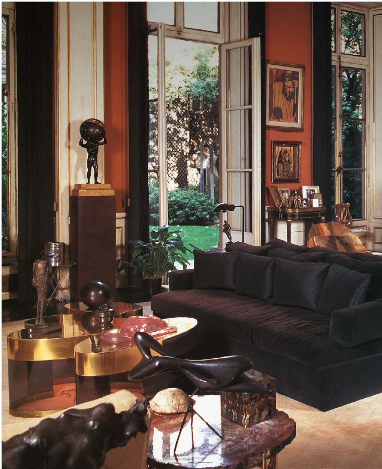
Henri Samuel Apartment, Paris.