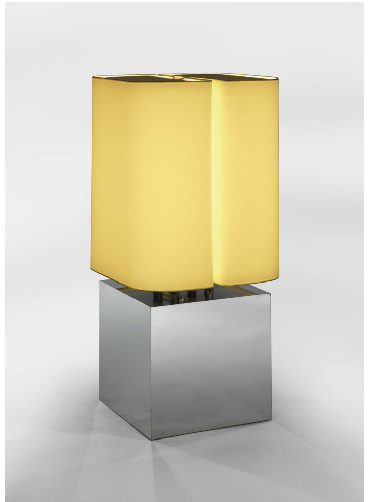
Michel Boyer Brasília Lamp (Large) , 1974 Polished steel base, linen shade with metal structure 43.31 H x 17.72 x 17.72 inches; 110 H x 45 x 45 cm

On view in the Demisch Danant stand will be the Élysée Lamp (1983) by Ronald Cecile Sportes; a rare large Brasília Lamp (1974) in stainless steel by Michel Boyer; and a number of rare lamps by Pierre Paulin, Jean-Paul Vitrac, Ben Swildens, Étienne Fermigier, Pierre Soulié, Sabine Charoy and others.