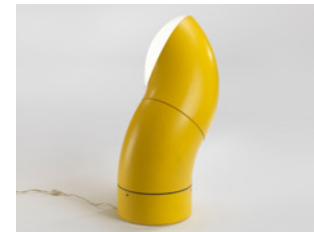
Piero Menichetti Tumbo Lamp, 1973 Painted cast aluminum, polycarbonate shade 24.41 H x 17.72 x 9.84 inches 62 H x 45 x 25 cm Edition Verre Lumiere