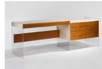
Roger Fatus Desk Commode , 1967 Oregon pine, lacquered wood, Plexiglas 28.54 H x 123.43 x 21.65 inches 72.5 H x 313.5 x 55 cm Edition La Meridienne