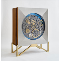
Maria Pergay Cabinet Engrenage , 2016 Brushed stainless steel façade; cabinet and interior drawers in lemon wood; base in brushed and polished brass; gears in Ti-black, Ti-blue and mirrored stainless steel 55.2 H x 44.09 x 19.69 inches 140.2 H x 112 x 50 cm Edition 1 of 8, with 4 APs