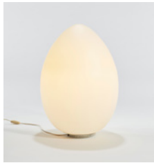
Ben Swildens Egg Lamp, 1969 Opaline glass, lacquered metal pedestal 24.41 H x 16.54 D inches 62 H x 42 D cm Edition Verre Lumiere