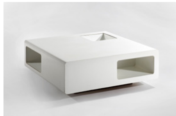
Michel Boyer Coffee Table , 1968 Formica, wood 13.78 H x 38.58 x 39.37 inches 35 H x 98 x 100 cm Edition Rouve