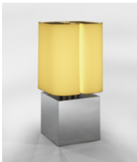
Michel Boyer Brasilia Lamp (Large) , 1974 Polished steel base, linen shade 43.31 H x 17.72 x 17.72 inches 110 H x 45 x 45 cm Edition Verre Lumiere