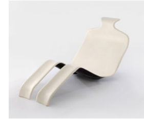
Olivier Mourgue Bouloum Lounge Chair , 1968 Molded fiberglass, gelcoat 26.5 H x 31.25 x 53 inches 67.3 H x 79.4 x 134.6 cm Edition Airborne