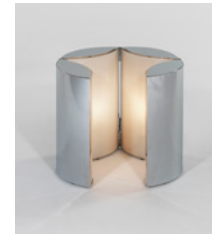
Jean-Pierre Vitrac Eventail Lamp, 1972 Chromed metal, opaline glass 11.81 H x 31.5 D inches 30 H x 80 D cm Edition Verre Lumiere