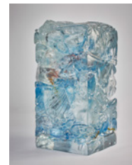
César Compression of Crystal, 1994 Glass crystal 16.93 H x 8.46 x 7.28 inches 43 H x 21.5 x 18.5 cm Unique work. Signed center left.