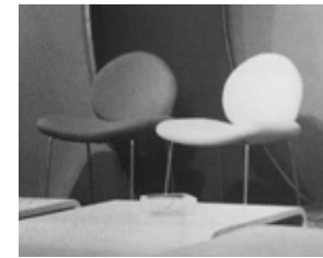
Olivier Mourgue Set of 4 chairs , 1966 Chromed metal base, fabric upholstery 31.5 H x 23.62 x 20.08 inches 80 H x 60 x 51 cm Seat height: 18.5 inches (47 cm) Edition Airborne