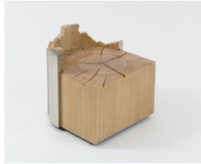
Maria Pergay Pouf Colonne/Column Seat , 2012 Stainless steel, oak 18.6 H x 19.5 x 19.5 inches 47.2 H x 49.5 x 49.5 cm Seat height: 13 inches (33 cm) Edition of 12