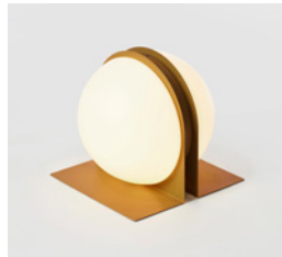
Ben Swildens Table Lamp, c. 1970s Lacquered metal, opaline glass 10.24 H x 9.84 x 9.84 inches 26 H x 25 x 25 cm Edition Verre Lumiere