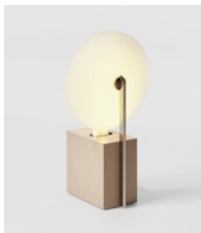
Sabine Charoy Lamp, 1981 Enameled metal, Plexiglas, compact fluorescent (CFL) 11.02 H x 3.94 x 3.94 inches 28 H x 10 x 10 cm Edition Verre Lumiere