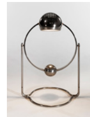
Pierre Soulié Table Lamp, 1969 Chromed metal, articulated arm 23.62 H x 15.75 D inches 60 H x 40 D cm Edition Verre Lumiere