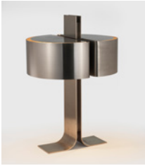
Verre Lumiere Studio Table Lamp, 1969 Brushed nickel 16.54 H x 9.06 x 9.06 inches 42 H x 23 x 23 cm Edition Verre Lumiere