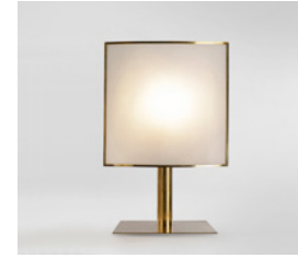
Michel Boyer Screen Lamp , 1975 Gilded brass, opaline glass 24.02 H x 15.75 x 11.81 inches 61 H x 40 x 30 cm Edition Verre Lumiere