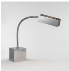
Michel Boyer Desk Lamp , 1968 Chromed metal, flexible arm 17.5 H x 17 x 4 inches 44.5 H x 43.2 x 10.2 cm Edition Verre Lumiere