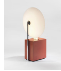
Sabine Charoy Lamp, 1981 Enameled metal, Plexiglas, compact fluorescent (CFL) 11.02 H x 3.94 x 3.94 inches 28 H x 10 x 10 cm Edition Verre Lumiere