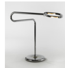
Ben Swildens Floor Lamp , 1967 Chromed steel, articulated arm 53.5 H x 47.5 inches 136 H x 121 cm Edition Verre Lumiere