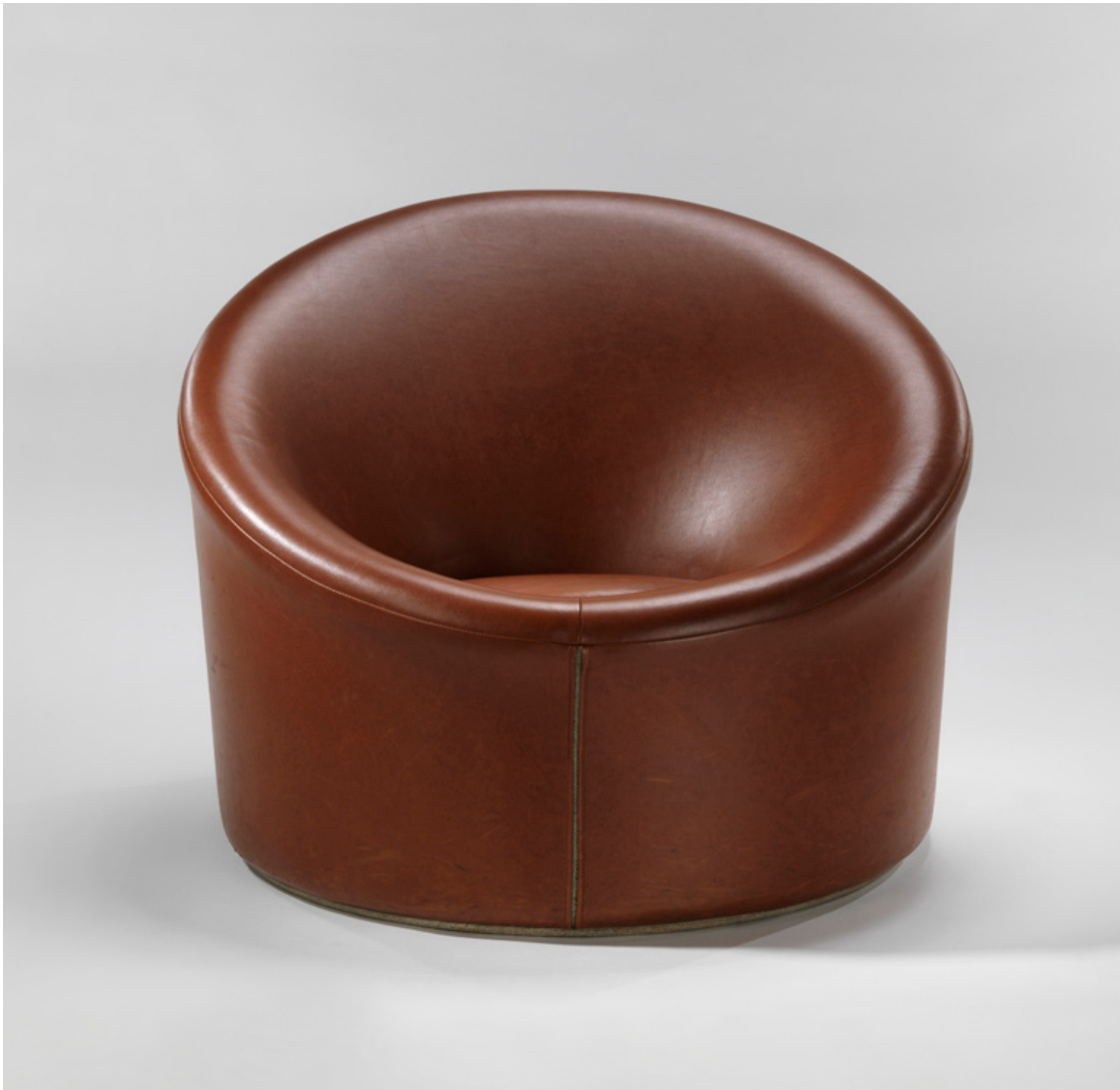
Pierre Paulin F566 'Straight' Mushroom Chair , c. 1960s Steel structure, foam, fabric 26.77 H x 30.71 D inches 68 H x 78 D cm Edition Artifort