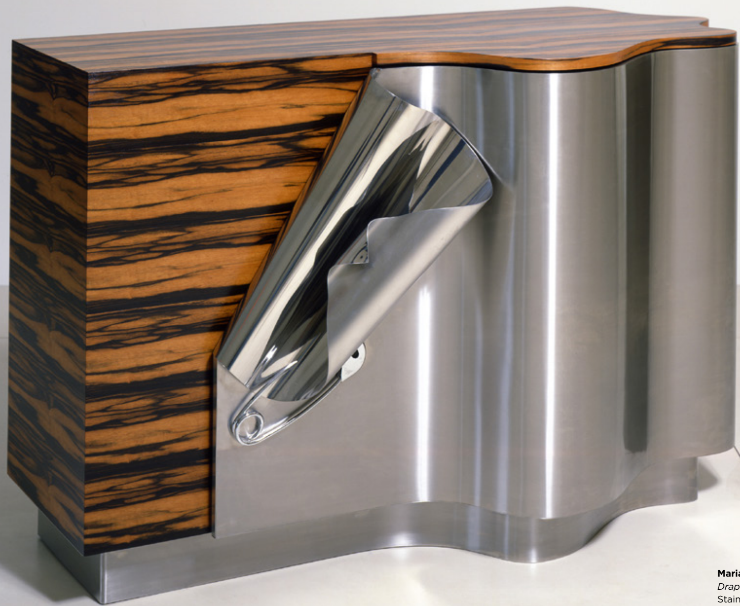
Maria Pergay Drape Cabinet B , 2005 Stainless steel, ebony macassar, palm wood 35.43 H x 54.33 x 25 inches 90 H x 138 x 63.5 cm Edition of 8