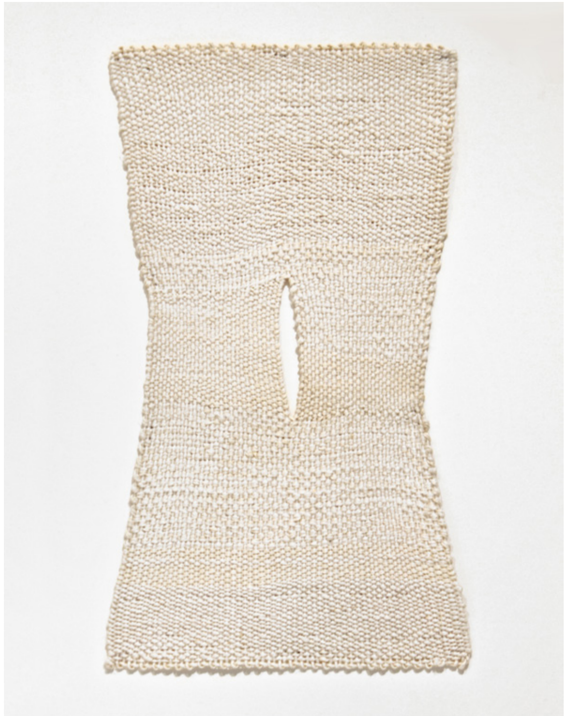
Sheila Hicks Button Hole , 1984 Linen 9.5 H x 5.75 inches 24.1 H x 14.6 cm