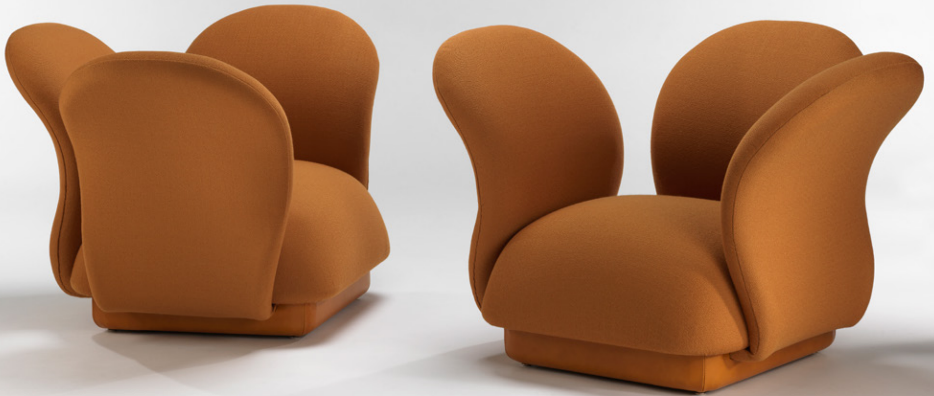
Pierre Paulin Pair of F281 Multimo Chairs, c. 1969-70 Stainless steel frame, foam, fabric, wood base 27 H x 43 x 33 inches 68.6 H x 109.2 x 83.8 cm Edition Artifort