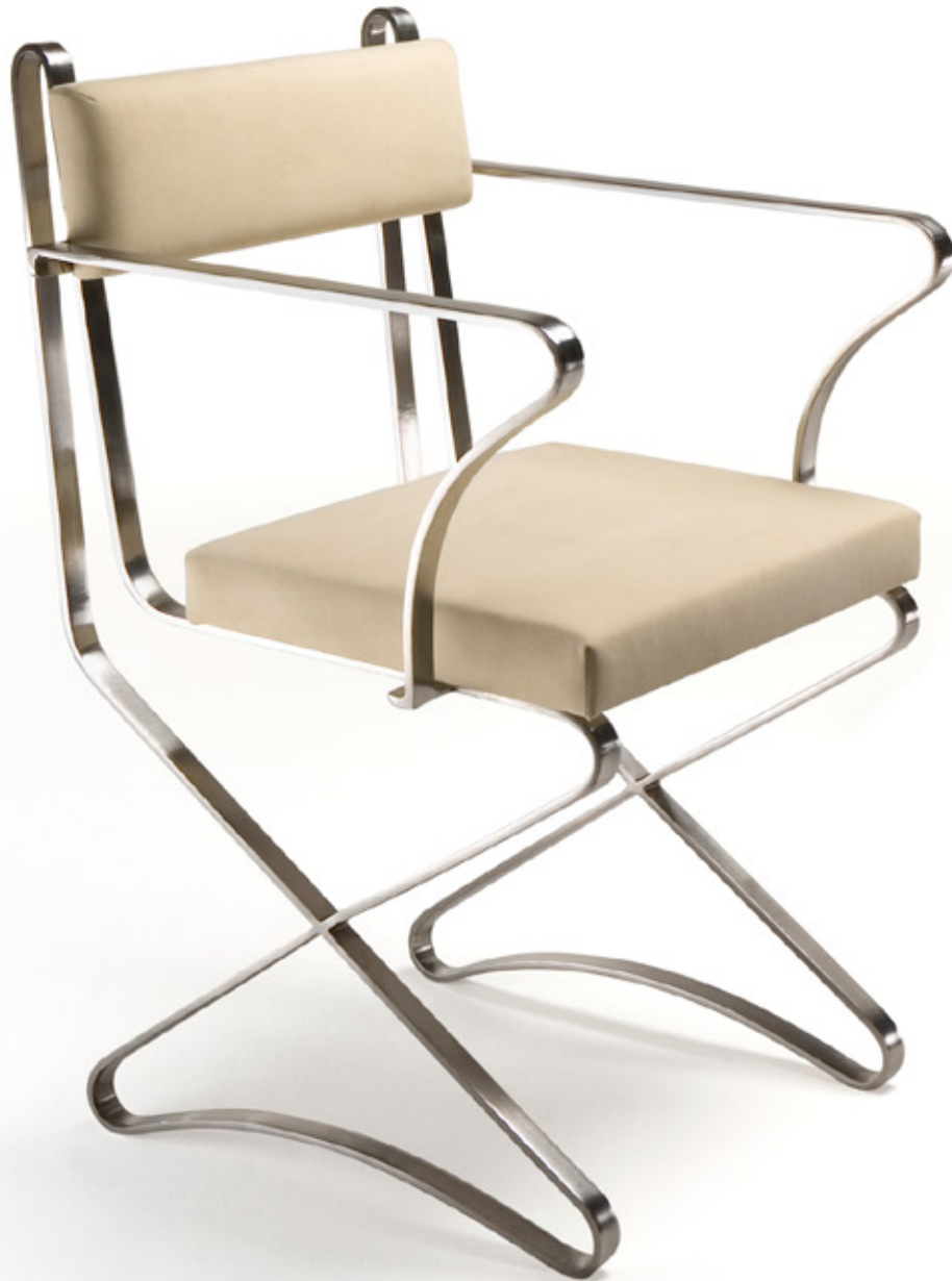
Maria Pergay Chaise X / X Chair with Arms, 1975/2017 Brushed stainless steel, foam, fabric 27.56 H x 20.47 x 22.05 inches 70 H x 52 x 56 cm Seat height: 16.93 inches (43 cm)