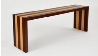
Michel Boyer Osaka Console , 1976 Wengé wood, oak 29.13 H x 82.68 x 19.69 inches 74 H x 210 x 50 cm Edition Mobilier International