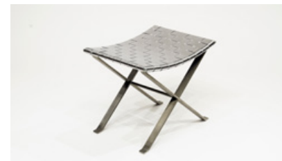
Michel Pigneres Stool , 1970 Stainless steel 18.5 H x 20.08 x 16.54 inches 47 H x 51 x 42 cm