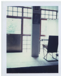
François Halard La Maison de Verre #7, 2007 Polaroid 3.5 x 4.25 inches 8.9 x 10.8 cm Unique work (FH3051)