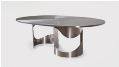
Maria Pergay Saturn Table, 1968 Stainless steel 28.74 H x 90.16 x 59.06 inches 73 H x 229 x 150 cm