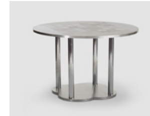
Attributed to François See Dining Table , 1970s Stainless steel 28 H x 43.38 D inches 71.1 H x 110.2 D cm