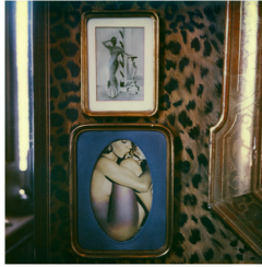
François Halard Carlo Mollino #1, 2004 Polaroid 3.5 H x 4.25 inches 8.9 H x 10.8 cm Unique work (FH3024)