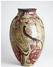
Galileo Chini Parrots & Pomegranates , c. 1920 Glazed earthenware 20 H x 11.5 D inches 50.8 H x 29.2 D cm