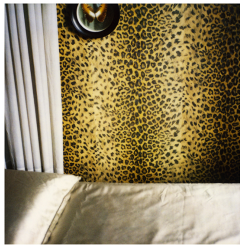
François Halard Carlo Mollino #11, 2004 Polaroid 3.5 H x 4.25 inches 8.9 H x 10.8 cm Framed: 12 H x 10.75 inches (30.5 H x 27.3 cm) Unique work (FH3034)