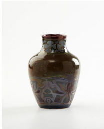
Galileo Chini Midnight Orchids , c. 1900 Glazed earthenware 6 H x 4.3 D inches 15.2 H x 10.9 D cm