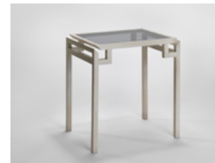
Jean-Michel Wilmotte Wing Table, 1974 Painted wood, smoked glass 24.41 H x 23.03 x 17.72 inches 62 H x 58.5 x 45 cm Edition Academy