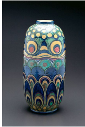
Galileo Chini Feathers and Blooms , 1904 Glazed earthenware 11.8 H x 5 D inches 30 H x 12.7 D cm

Collection of Jason Jacques: Available Works