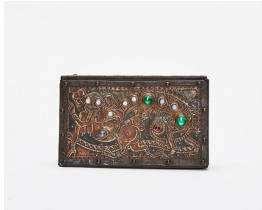
Alfred Daguet Canine Attack , c. 1897 Patinated steel, enameled and gilded copper, glass cabochons 1.5 H x 5.5 x 3.5 inches 3.8 H x 14 x 8.9 cm