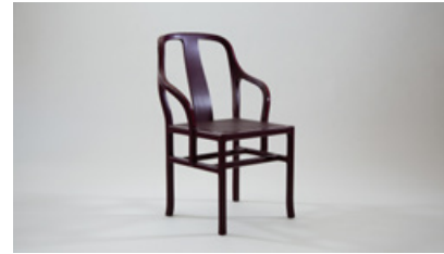
Pierre Paulin Chaise à Palmette, 1981 Lacquered wood, caned seat 35.04 H x 22.44 x 16.93 inches 89 H x 57 x 43 cm Seat height: 18 inches (45.72 cm) Limited Edition Pierre Paulin SARL Manufactured by Ségransan