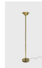
Jacques Grange Floor Lamp , c. 1980s Patinated brass, metal halogen 73.23 H x 11.81 x 11.81 inches 186 H x 30 x 30 cm Edition Maison Meilleur for Yves Saint Laurent