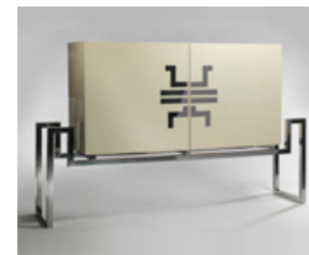
Maria Pergay Cabinet, c. 1970 Chromed metal, lacquered wood 50.98 H x 83.27 x 18.9 inches 129.5 H x 211.5 x 48 cm