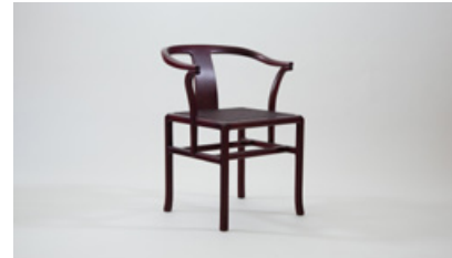
Pierre Paulin Amaranth Chair, 1981 Amaranth wood, caned seat 29.53 H x 21.65 x 17.32 inches 75 H x 55 x 44 cm Limited Edition Pierre Paulin SARL Manufactured by Ségransan