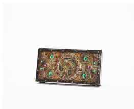
Alfred Daguet Green Treasure , Patinated steel, enameled and gilded copper, glass cabochons Patinated steel, enameled and gilded copper, glass cabochons 1.75 H x 8 x 4.25 inches 4.4 H x 20.3 x 10.8 cm