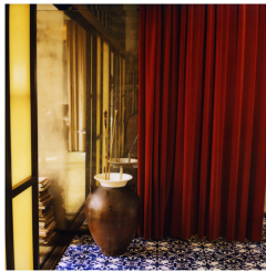
François Halard Carlo Mollino #10, 2004 Polaroid 3.5 H x 4.25 inches 8.9 H x 10.8 cm Framed: 12 H x 10.75 inches (30.5 H x 27.3 cm) Unique work (FH3033)