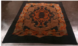
Arnold Pijpers Dutch Kinheim Arthropod Rug , c. 1925 Wool, natural fibers 135.7 x 98.75 inches 344.7 x 250.8 cm