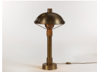
Marc Held Lamp , 1983 Brass 25.98 H x 13.39 D inches 66 H x 34 D cm Shade: 6.5 H inches (16.5 H cm) Base: 6.5 D inches (16.5 D cm) Edition Arlus