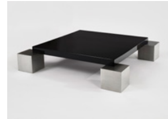
Nadine Charteret Low Table , 1972 Steel cube legs, lacquered wood top, fluorescent light 13.39 H x 42.13 x 42.13 inches 34 H x 107 x 107 cm Edition Interieurs Contemporains