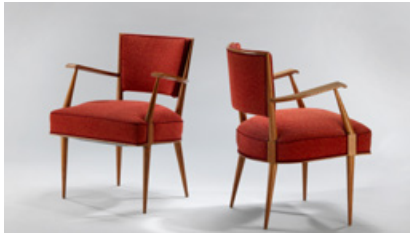
Jacques Dumond Pair of Oak Bridge Chairs , 1938 Oak, foam, fabric 31.5 H x 23.62 x 23 inches 80 H x 60 x 58.4 cm Seat height: 18.5 inches (47 cm)