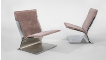
Pierre Folie Pair of Chairs, 1972 Stainless steel, suede 27.95 H x 24.02 x 25.59 inches 71 H x 61 x 65 cm Seat height: 13.78 inches (35 cm) Edition Charpentier