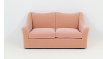
French Sofa , 1970s Wood frame, foam, fabric 31.5 H x 57 x 28.75 inches 80 H x 144.8 x 73 cm Seat height: 15 inches (38.1 cm) Edition Mobilier International