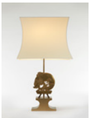
Maria Pergay Lampe Dragon / Dragon Lamp, 1974 Bronze, stainless steel 31.5 H x 18.25 x 11.5 inches 80 H x 46.4 x 29.2 cm