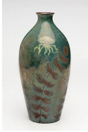
Pietro Melandri Jelly Fish , c. 1925 Glazed earthenware 16.3 H x 7.8 D inches 41.4 H x 19.8 D cm