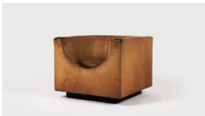
Bernard Govin Elliptique Armchair , c. 1965 Wood structure, molded foam, leather 23.62 H x 29.92 x 29.13 inches 60 H x 76 x 74 cm Seat height: 13 inches (33 cm) Edition Saporiti Italia