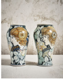
Galileo Chini Pre-Raphaelite Ladies , c. 1898 Glazed earthenware 10.3 H x 5.8 D inches 26.2 H x 14.7 D cm