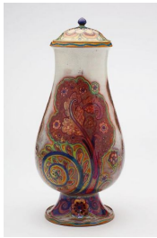
Galileo Chini Golden Blooms , c. 1900 Glazed earthenware 18.3 H x 7.5 D inches 46.5 H x 19.1 D cm