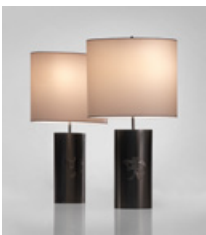
Maria Pergay Pair of Brass Lamps, 1974 Brass 33.46 H x 7.48 D inches 85 H x 19 D cm