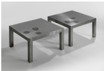
Maria Pergay Low Tables , 1970 Stainless steel, pyrite inlay Each: 13.78 H x 23.62 x 23.62 inches Each: 35 H x 60 x 60 cm