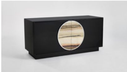
Maria Pergay Cabinet with Marble Disc, c. 1974 Black lacquered wood, marble 25.59 H x 62.99 x 23.62 inches 65 H x 160 x 60 cm