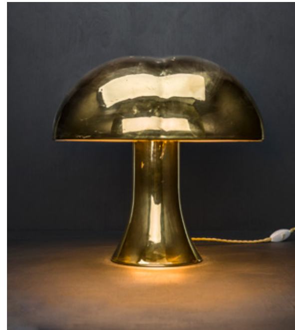
JOS DEVRIENDT Night and Day 214 2018 Glazed stoneware 14.76 H x 15.55 x 12.4 inches 37.5 H x 39.5 x 31.5 cm Unique work