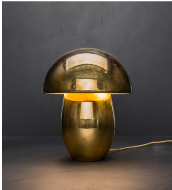
JOS DEVRIENDT Night and Day 219 2018 Glazed stoneware 11.81 H x 9.84 D inches 30 H x 25 D cm Unique work