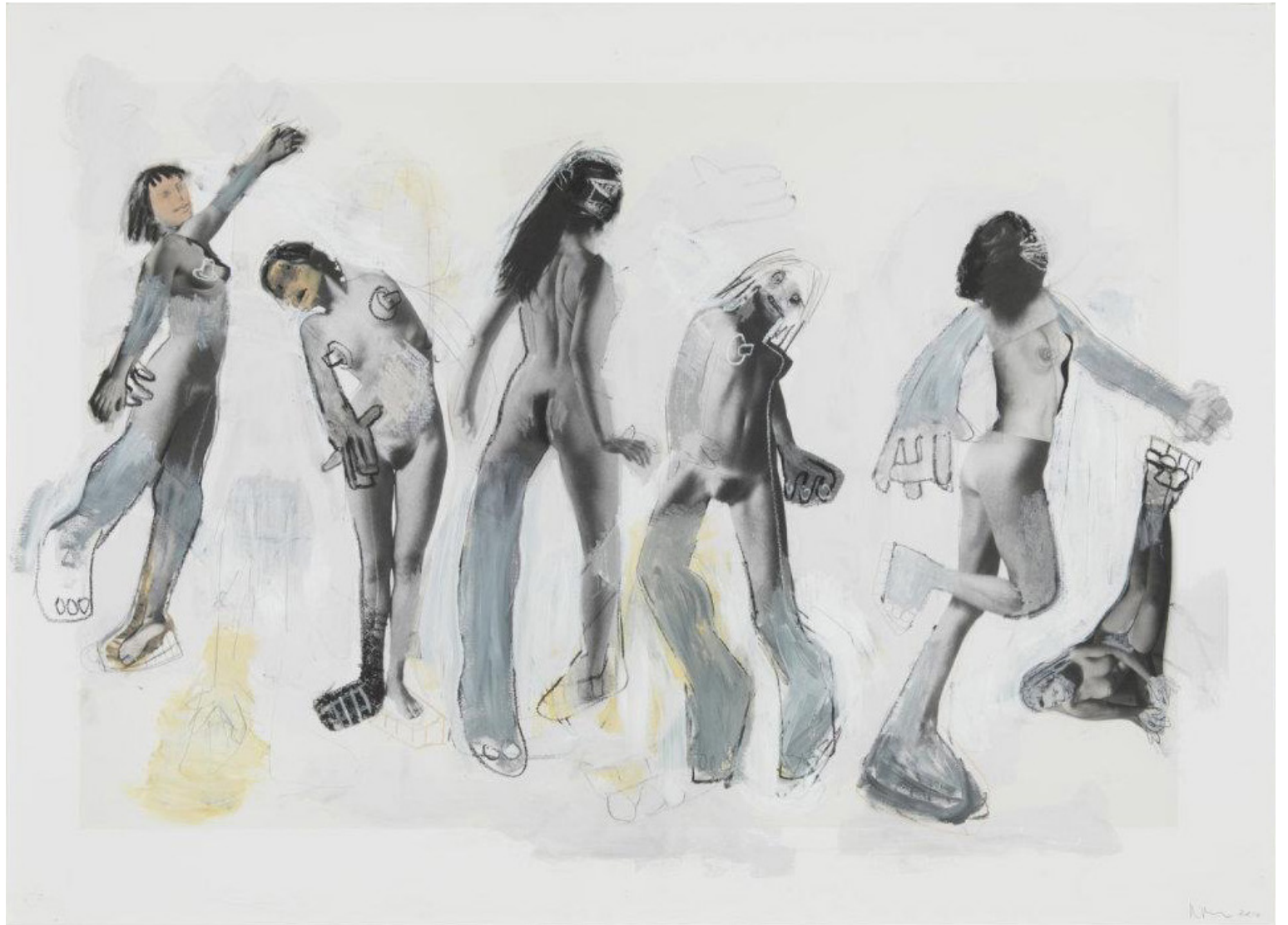
Untitled 2010 Ink jet, acrylic, oil crayon, and graphite on paper 37 1/8 x 51 1/4 in. (94.3 x 130.2 cm) Framed: 39 x 53 1/4 in. (99.1 x 135.3 cm)