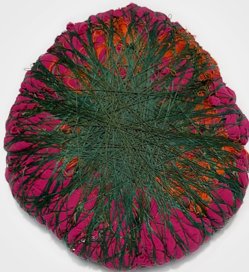
SHEILA HICKS Petite Boule Rose 2018-19 Linen, cotton, synthetic fibers 6.69 H x 7.09 x 3.15 inches 17 H x 18 x 8 cm