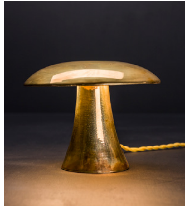
JOS DEVRIENDT Night and Day 222 2018 Glazed stoneware 4.92 H x 6.69 D inches 12.5 H x 17 D cm Unique work