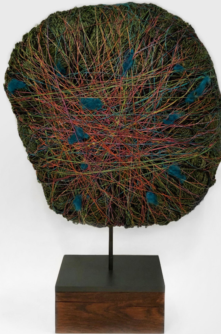
SHEILA HICKS Le Filet Capture 2017 Linen, cotton, synthetic fibers 15.75 H x 14.96 x 7.87 inches 40 H x 38 x 20 cm Height with stand: 22.8 inches (58 cm)