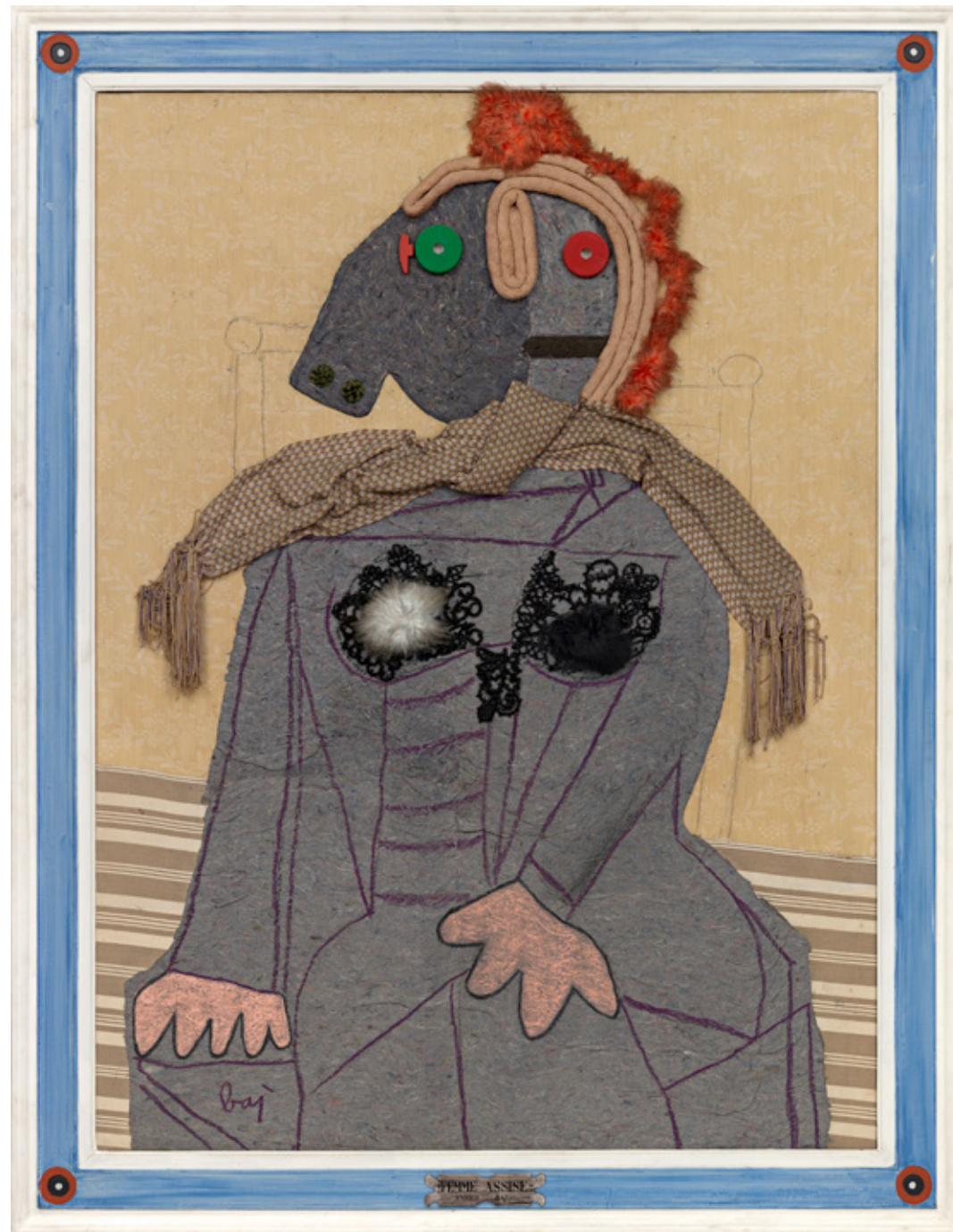
Femme Assise 1966 Acrylic, collage, padding, Passementerie, and objects on fabric in artist's frame 59 1/8 x 45 5/8 in. (150 x 116 cm)