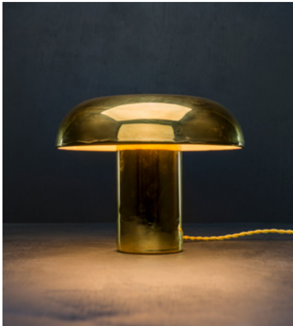
JOS DEVRIENDT Night and Day 206 2018 Glazed stoneware 8.07 H x 10.63 D inches 20.5 H x 27 D cm Unique work