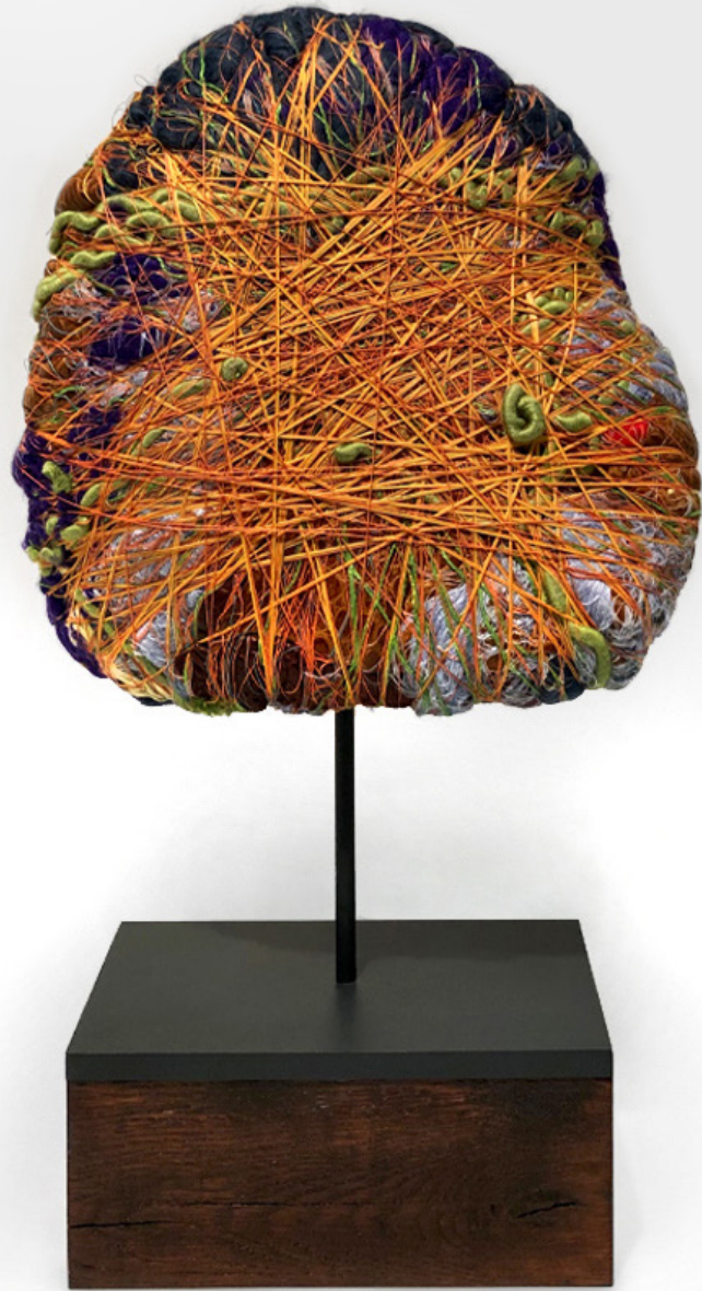
SHEILA HICKS La Duchesse 2018-19 Linen, cotton, synthetic fibers 10.63 H x 11.02 x 5.91 inches 27 H x 28 x 15 cm Height with stand: 19.3 inches (49 cm)