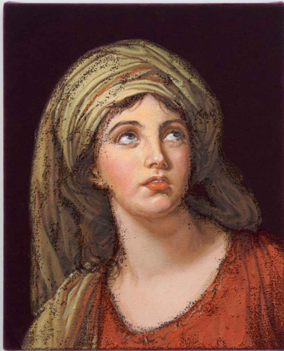
Untitled (Emma Lyon as Cumaean Sibyl) 2019 Ink and acrylic on mohair velvet over canvas 22 3 / 8 x 18 3 / 8 in. (56.8 x 46.7 cm)