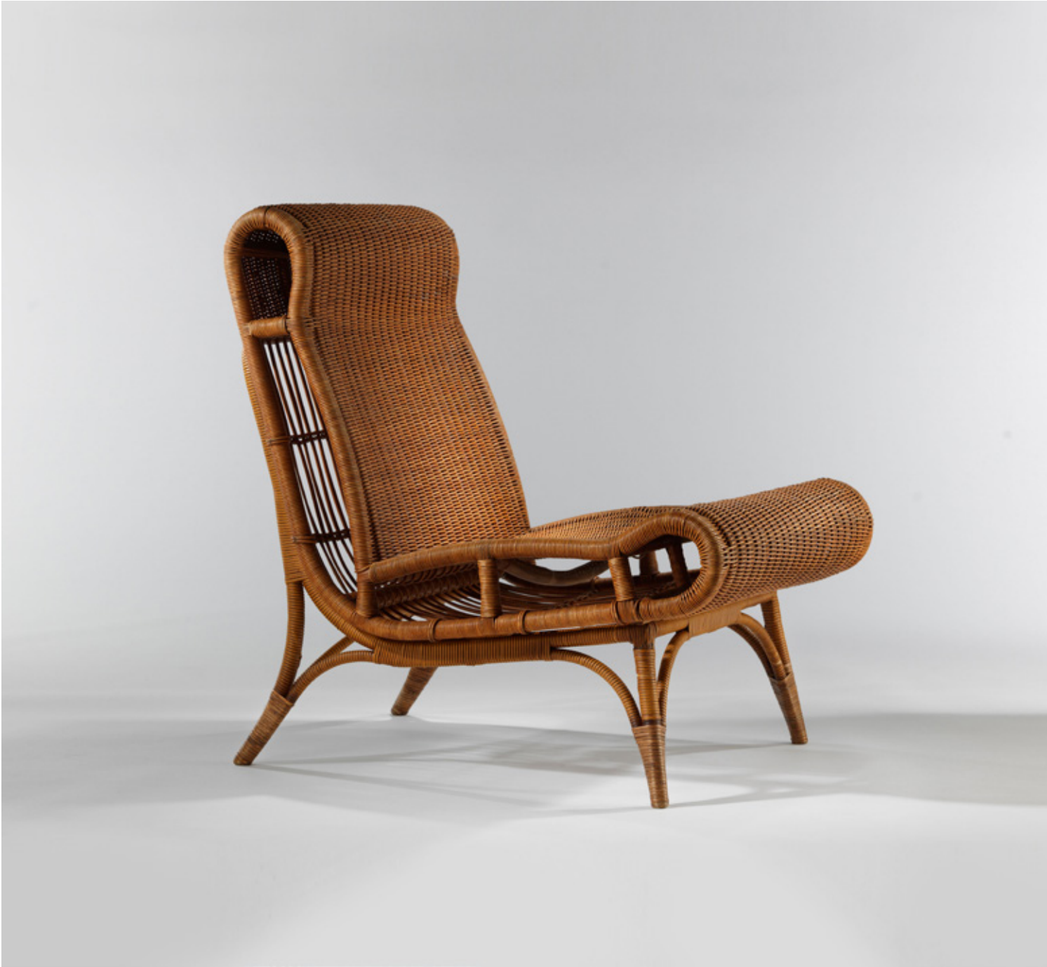
JANINE ABRAHAM Bourboule Chair 1954 Rattan 31.5 H x 24.02 x 30.31 inches 80 H x 61 x 77 cm Seat height: 16 inches (41 cm) Edition Rougier