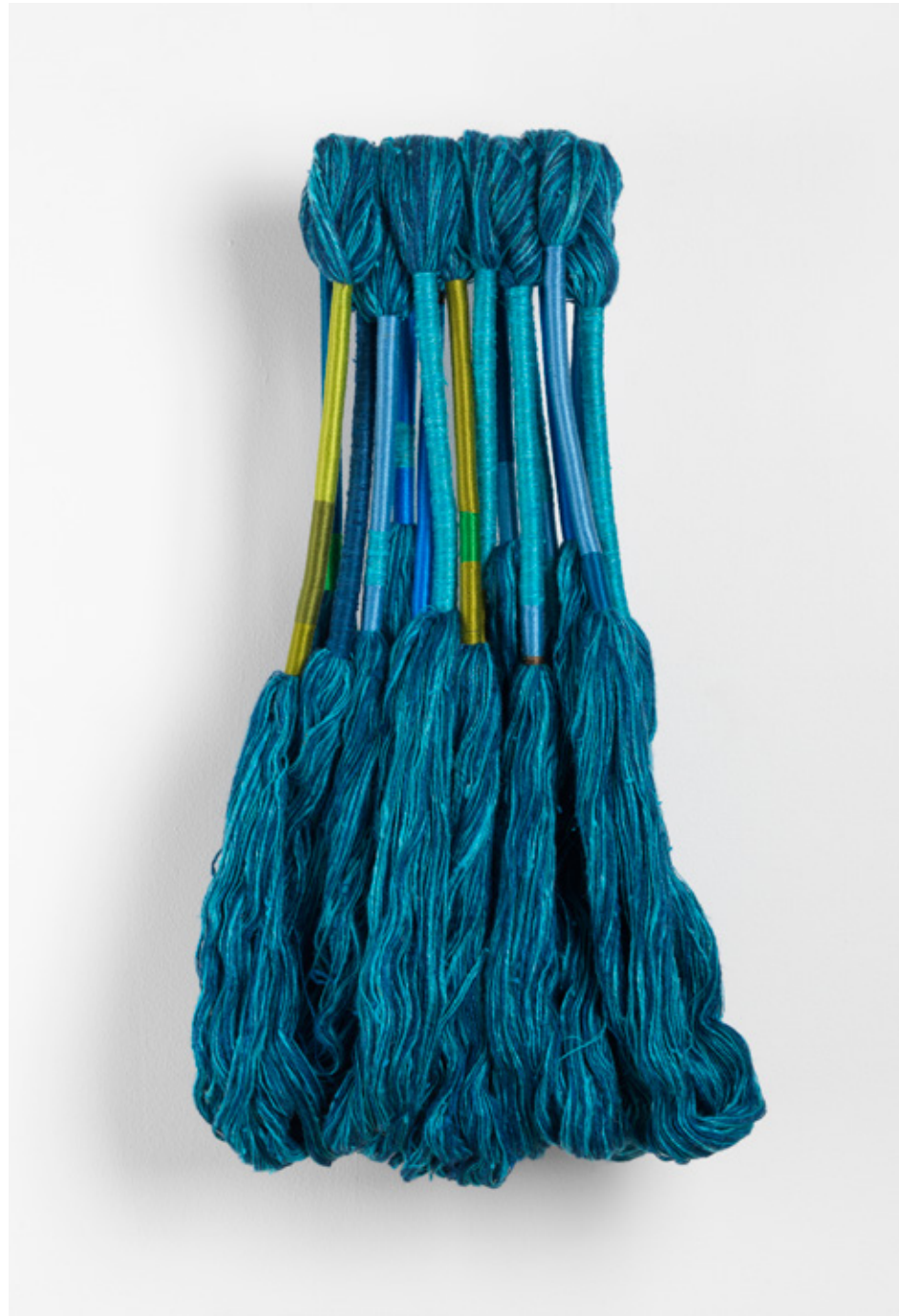
SHEILA HICKS Tapisserie 1980 Cotton, silk 8 H x 23 x 14 inches 20.3 H x 58.4 x 35.6 cm