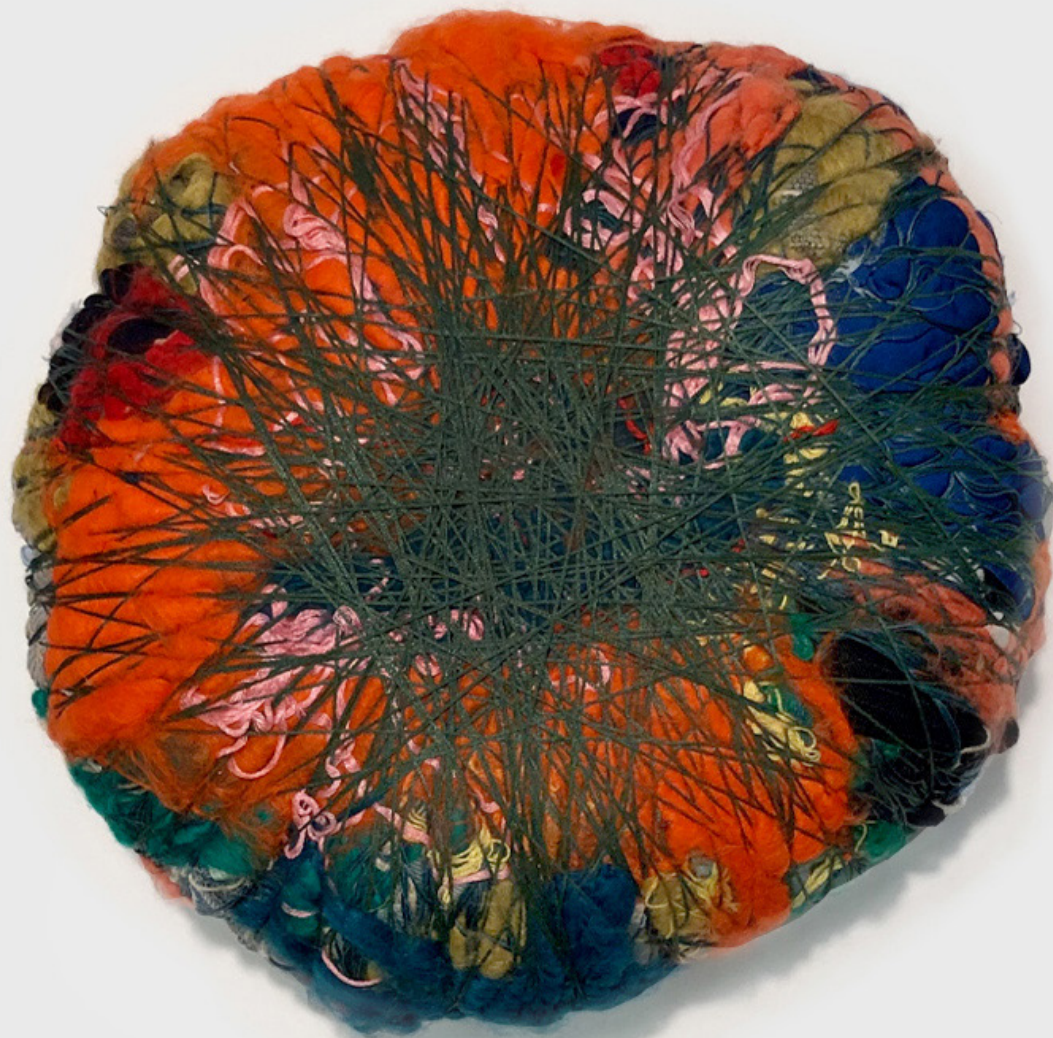
SHEILA HICKS Untitled 2018-19 Linen, cotton, synthetic fibers 9.84 H x 9.84 x 4.33 inches 25 H x 25 x 11 cm