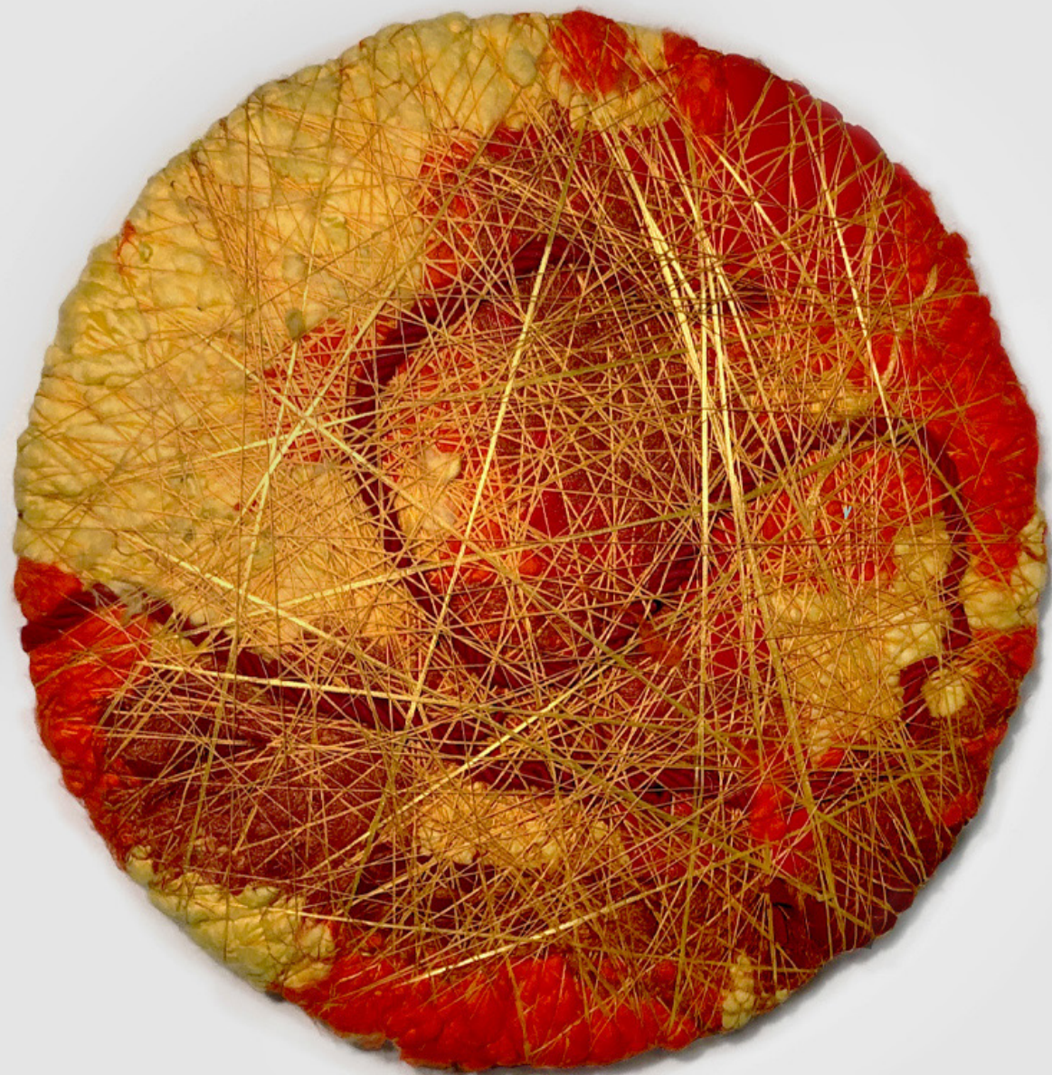
SHEILA HICKS As you grow older you are never better than you were 2018-19 Linen, cotton, synthetic fibers 20.87 H x 20.47 x 4.33 inches 53 H x 52 x 11 cm