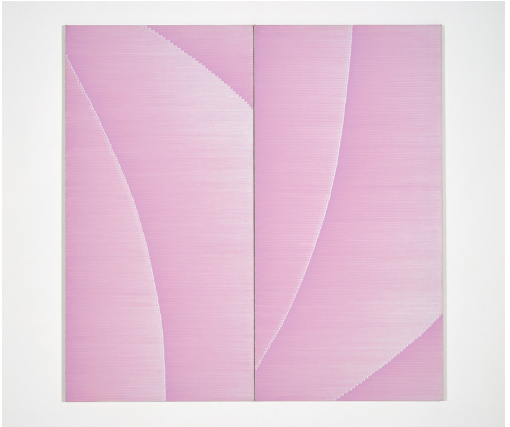
Radical Writings, Einatmen Ausatmen, II 1987 Acrylic on canvas, diptych Each: 55 1/8 x 27 1/2 in. (140 x 70 cm) Overall: 55 1/8 x 55 1/8 in. (140 x 140 cm)