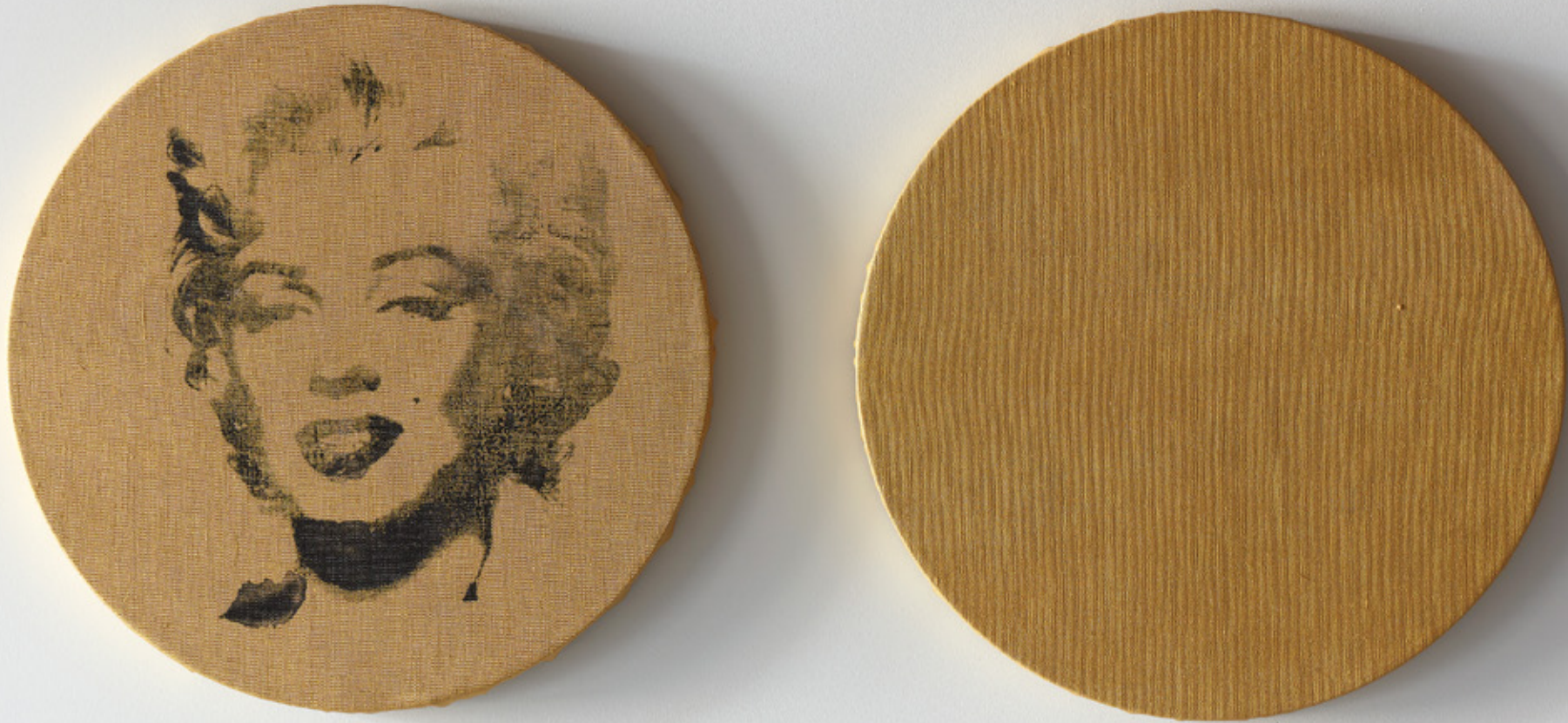
Warhol Gold Marilyn 1973/2004 Silkscreen on canvas in two parts Each diameter: 18 in. (45.7 cm)