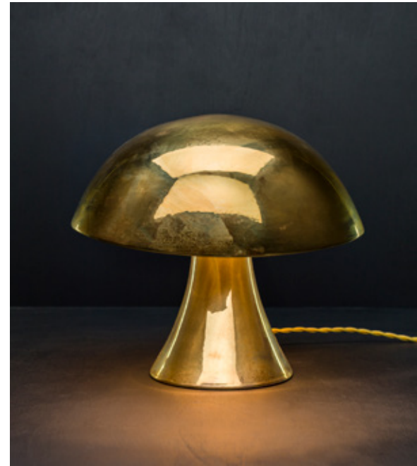
JOS DEVRIENDT Night and Day 209 2018 Glazed stoneware 10.83 H x 12.6 x 10.63 inches 27.5 H x 32 x 27 cm Unique work