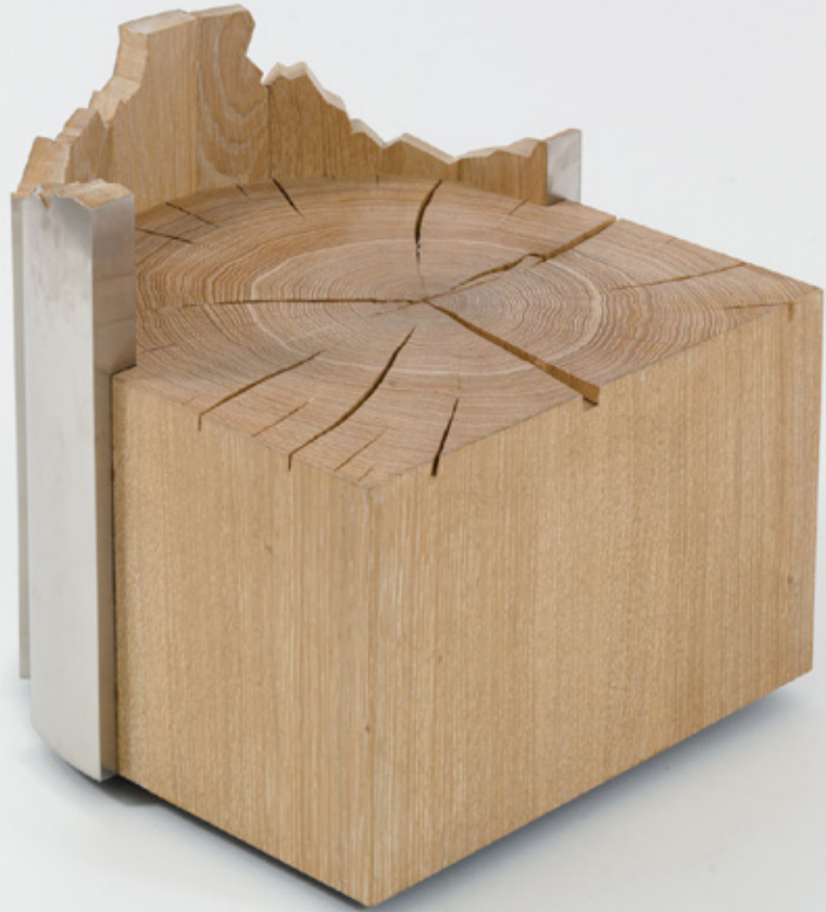
MARIA PERGAY Pouf Colonne / Column Seat 2012 Stainless steel, oak 18.6 H x 19.5 x 19.5 inches 47.2 H x 49.5 x 49.5 cm Seat height: 13 inches (33 cm) Edition of 8, with 4 AP