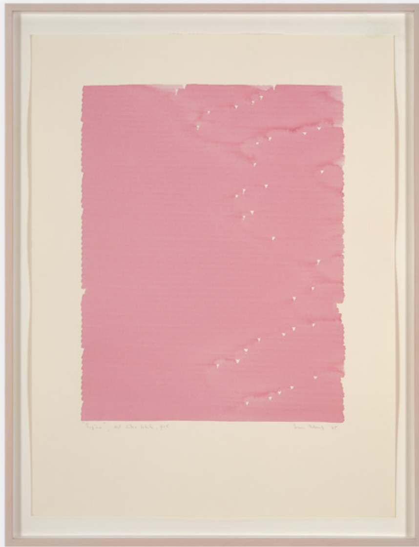
Radical Writings, Pagina, dal libro totale Y-5 1985 Watercolor on paper 20 1/8 x 14 3/4 in. (51 x 37.5 cm)