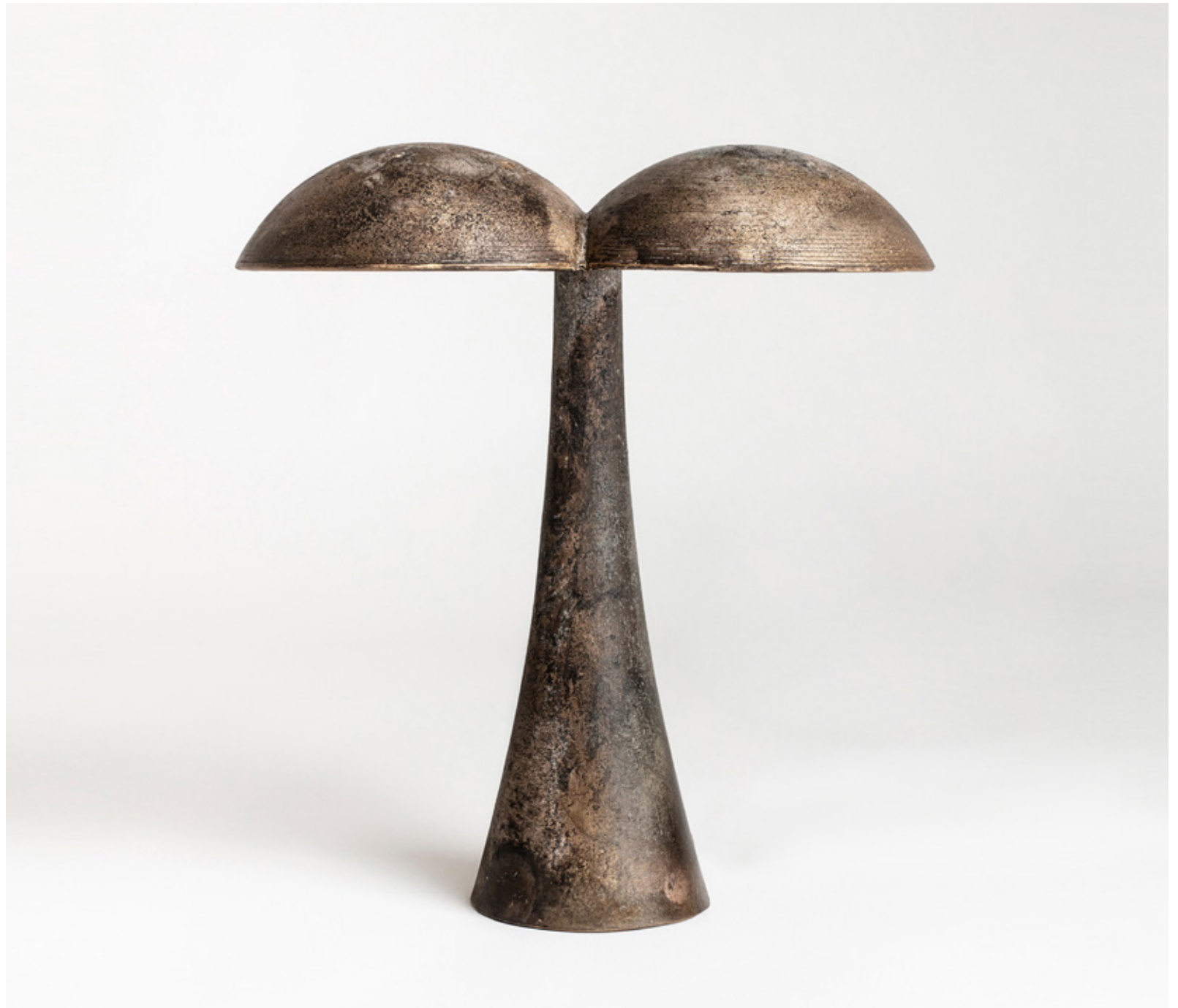
JOS DEVRIENDT Night and Day 230 2018 Bronze 14.17 H x 12.6 x 7.09 inches 36 H x 32 x 18 cm Unique work