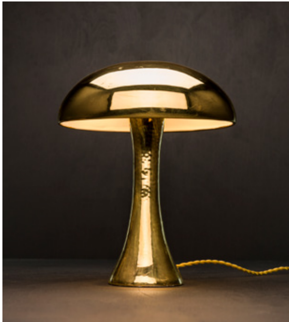
JOS DEVRIENDT Night and Day 203 2018 Glazed stoneware 11.42 H x 9.65 x 6.3 inches 29 H x 24.5 x 16 cm Unique work