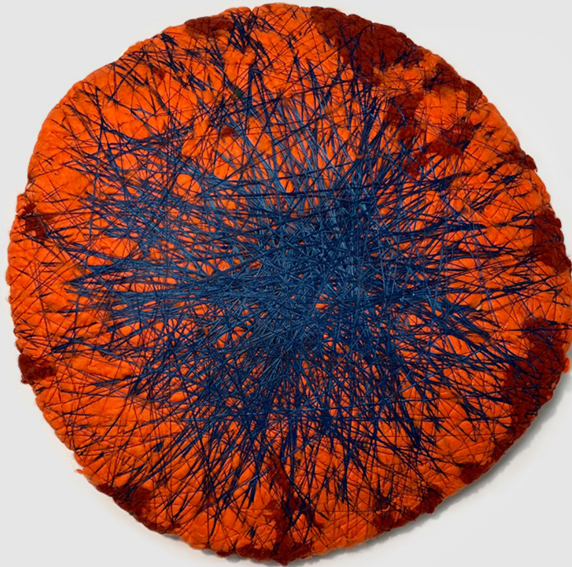
SHEILA HICKS Evolving Tapestry 2018-19 Linen, cotton, synthetic fibers 19.69 H x 20.87 x 4.72 inches 50 H x 53 x 12 cm