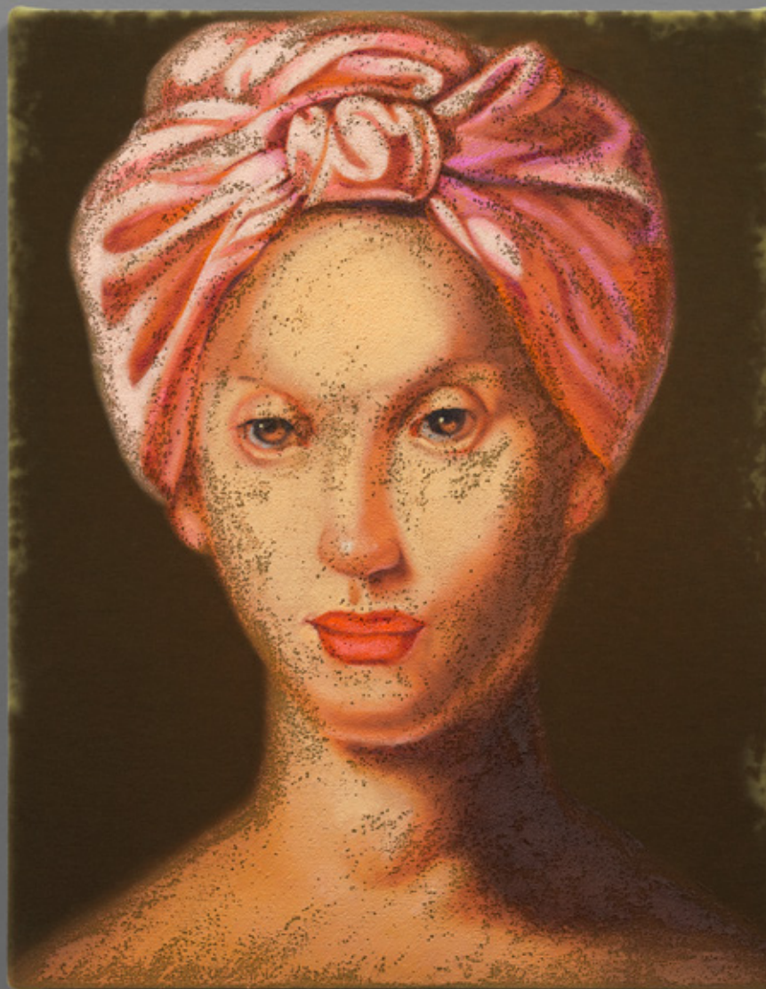
Untitled (Tamara de Lempicka) 2019 Ink and acrylic on mohair velvet over canvas 28½ x 22¼ in. (72.4 x 56.5 cm)