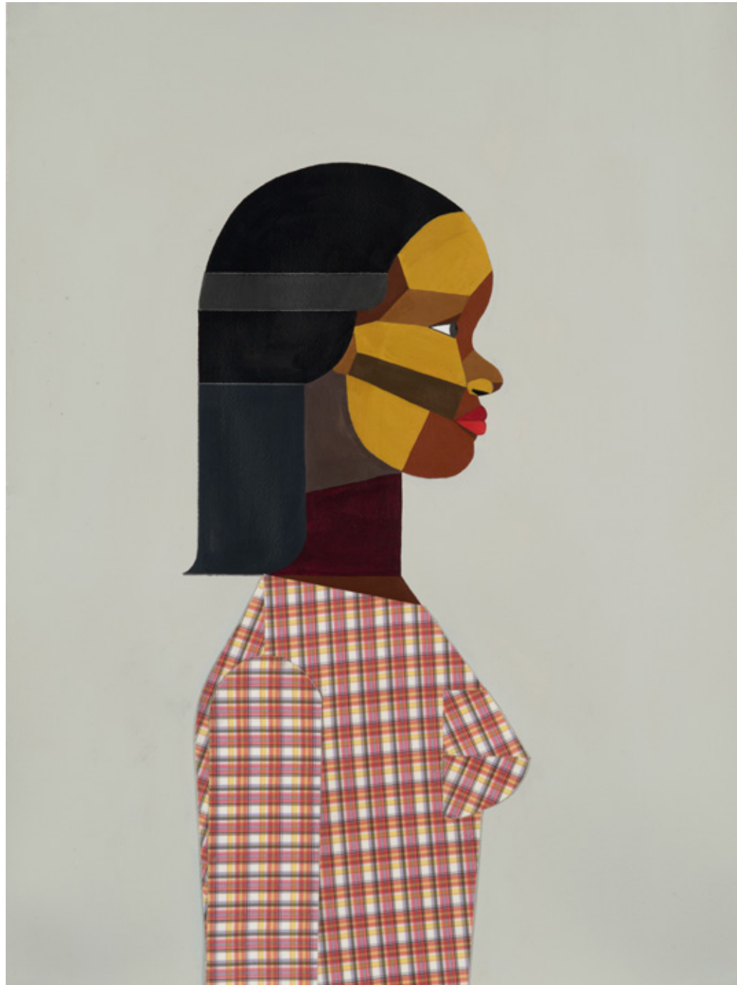
Interior Life (Figure 15) 2019 Acrylic paint, pencil, and fabric on paper 24 x 18 in. (61 x 45.7 cm)