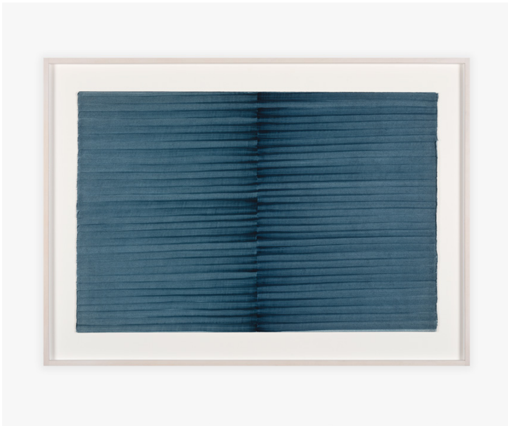
Radical Writings, Schriftzug- Atemzug, Übung 2 vom 26-6-88 1988 Acrylic on card 15 x 22 ¼ in. (38 x 56.5 cm)