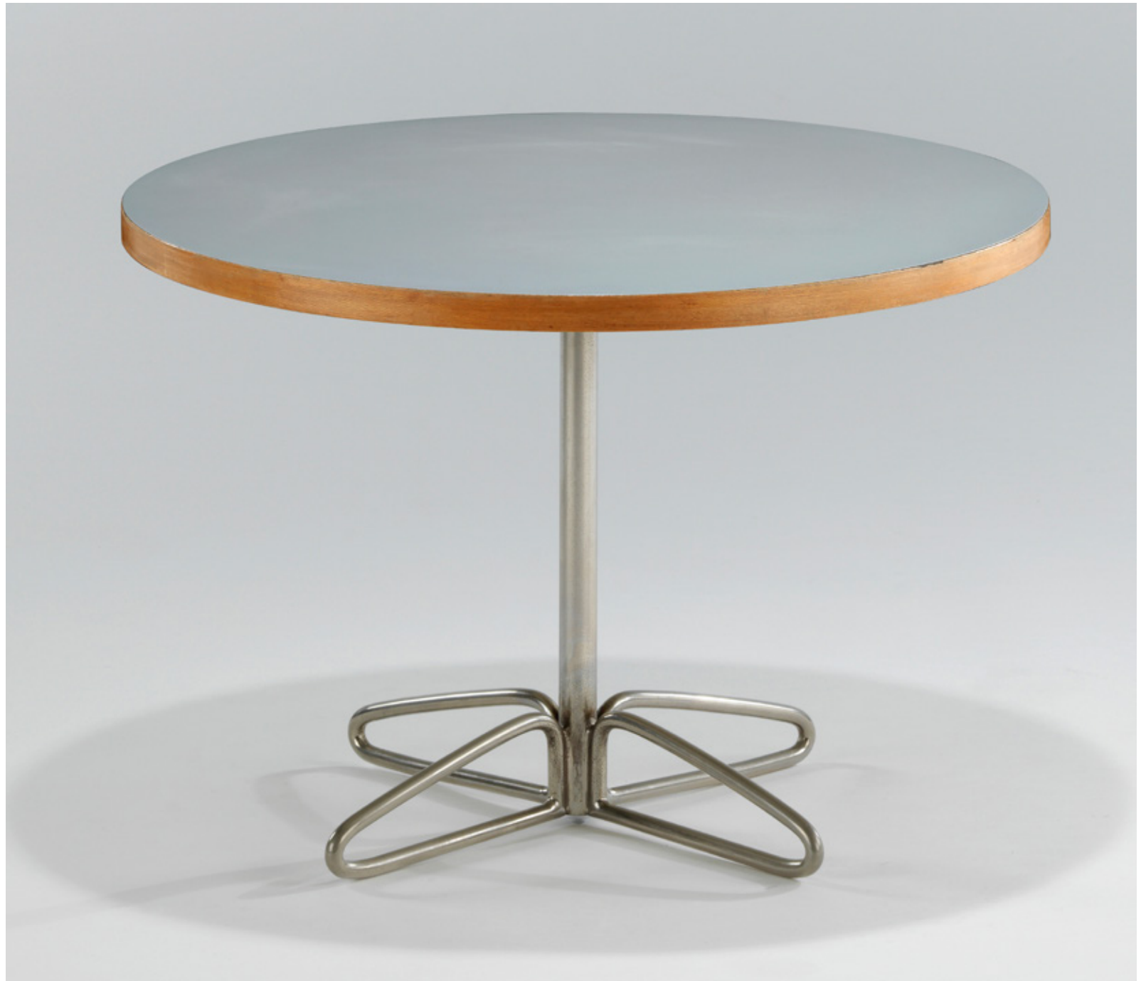
GENEVIÈVE DANGLES AND CHRISTIAN DEFRANCE Gueridon 1960 Nickel-plated metal, wood, Formica 16.34 H x 23.62 D inches 41.5 H x 60 D cm Edition Burov