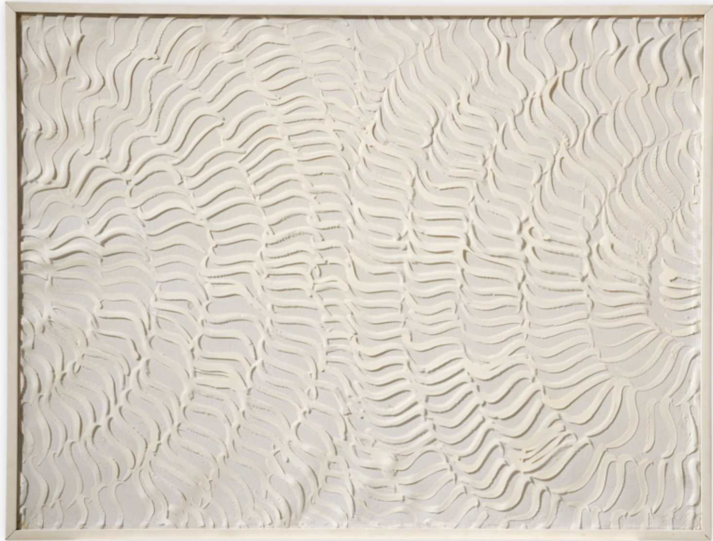
Biancobianco 1966 Varnish on sicofoil on painted canvas 26 3/4 x 35 3/8 in. (68 x 90 cm)