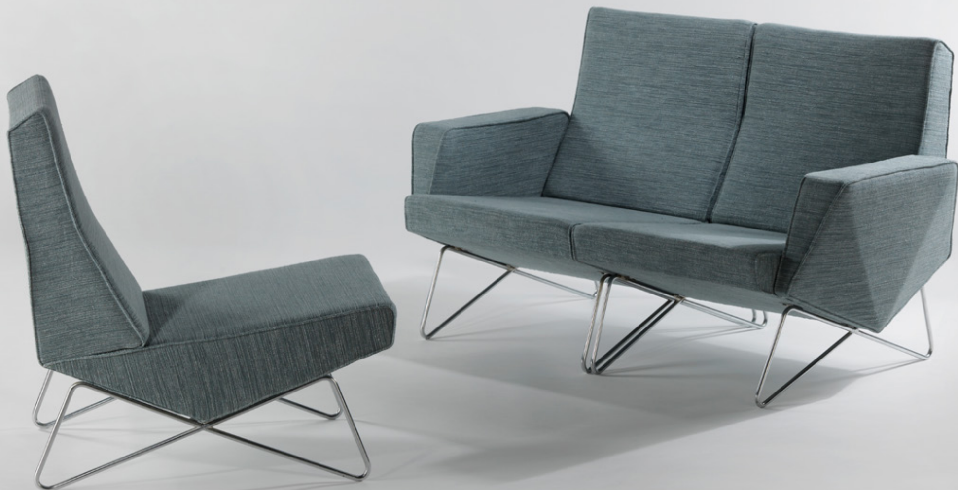
GENEVIÈVE DANGLES AND CHRISTIAN DEFRANCE Modular Sofa 1961 Metal, wood, foam, fabric 31.5 H x 75.39 x 31.5 inches 80 H x 191.5 x 80 cm Seat height: 15.35 inches (39 cm) Edition Wikfrom