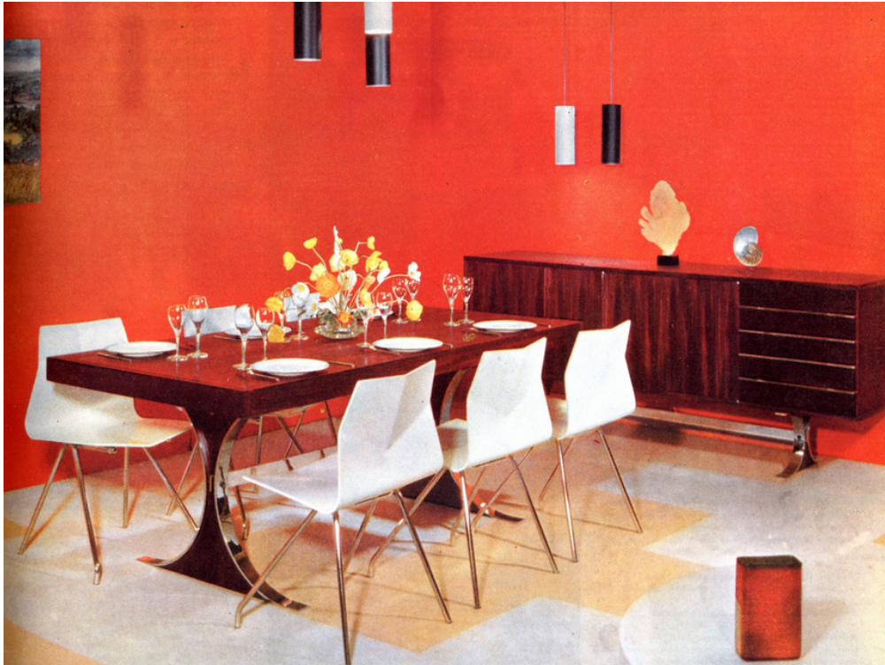
Archival image: Presentation at the Salon des arts Ménagers, 1961

18 Sep–30 Oct 2014 at Demisch Danant Gallery, New York