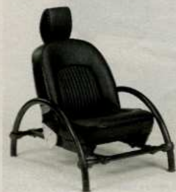
(1) Ron Arad's 1981 Rover Chair; (2) Danny Lane's 1987 Etruscan Chair; (3) Pentagon Group's D8 chair from 1987; (4) Shiro Kuramata's 1986 How High the Moon chair for Vitra; (5) Jasper Morrison's 1985 Wing-nut Chair.