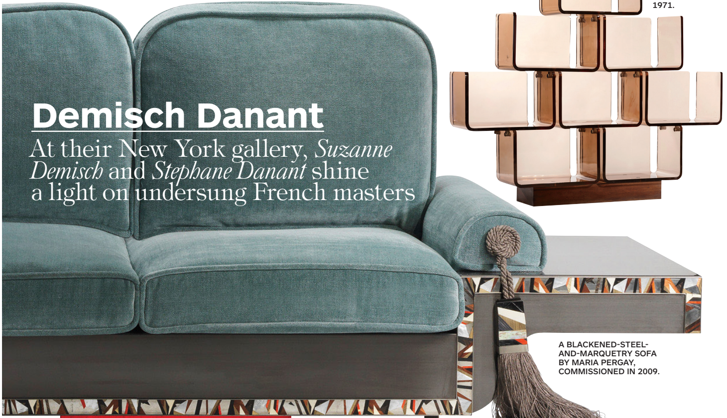
PIERRE PAULIN'S ÉLYSÉE BOOKCASE, 1971.