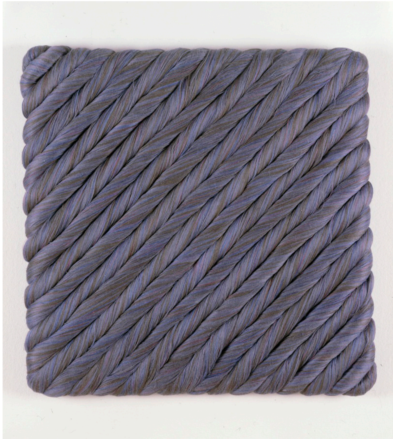
SHEILA HICKS PCP , 1988 Plaited silk threads on canvas 21 x 21 x 1.75 inches 53.3 x 53.3 x 4.4 cm