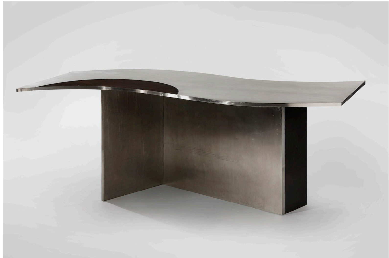
MARIA PERGAY Bureau S / Wave Desk, 1968 Stainless steel with leather insert 29.13 H x 78.74 x 17.72 inches 74 H x 200 x 45 cm