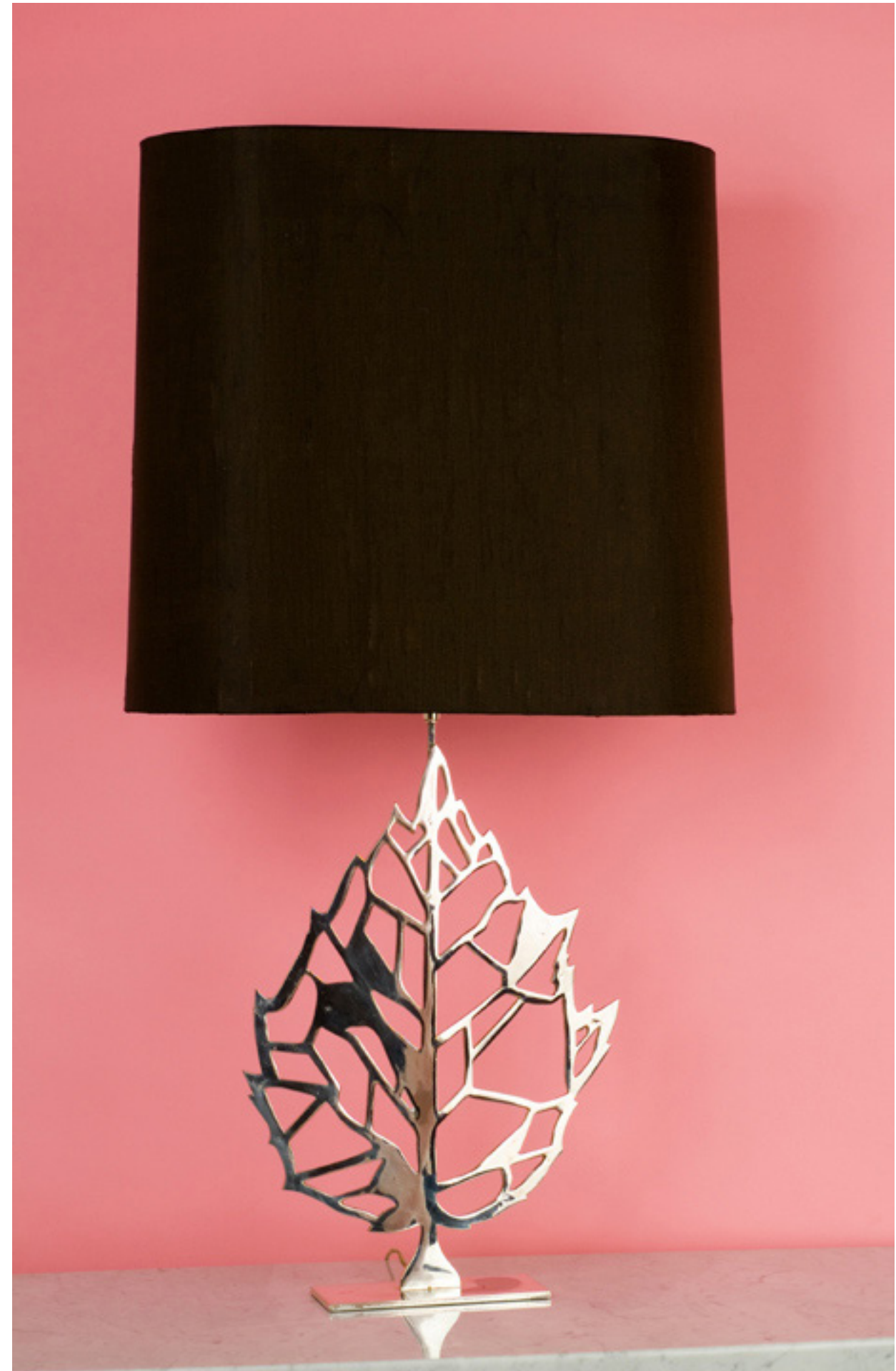
MARIA PERGAY Lampe Feuille / Leaf Lamp , 1960 c. Silver-plated brass Shade, approx: 19.69 x 17.72 inches 50 x 45 cm Base, approx: 19.69 x 17.72 inches 50 x 45 cm Pair available