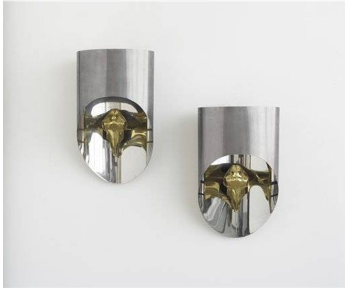
MARIA PERGAY Paire de Applique Totem / Pair of Totem Sconces, 1974 c. Stainless steel, bronze 14 x 24 H inches 35.6 x 61 H cm 3 available