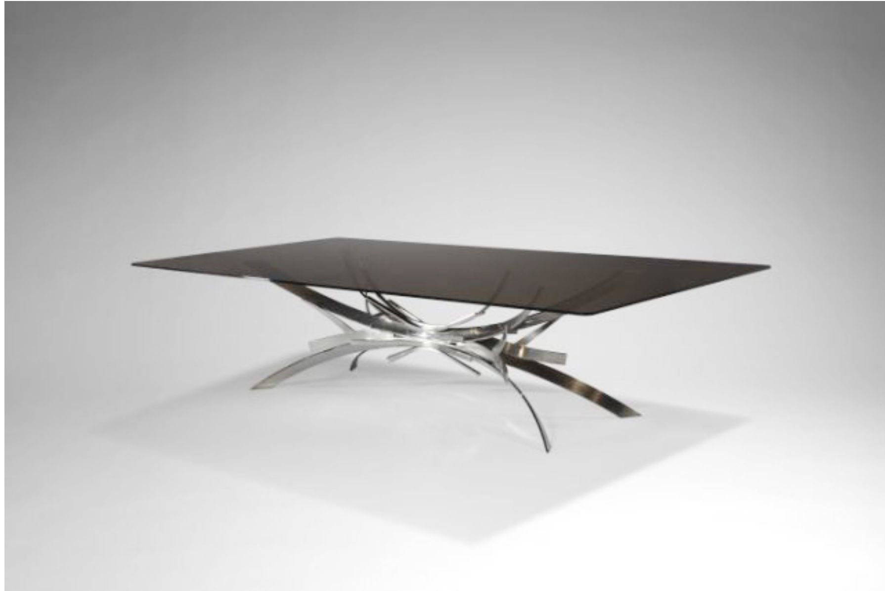
MARIA PERGAY Table Gerbe / Gerbe Table , 1970 Stainless steel, glass 27.95 x 118.11 x 62.99 inches 71 x 300 x 160 cm