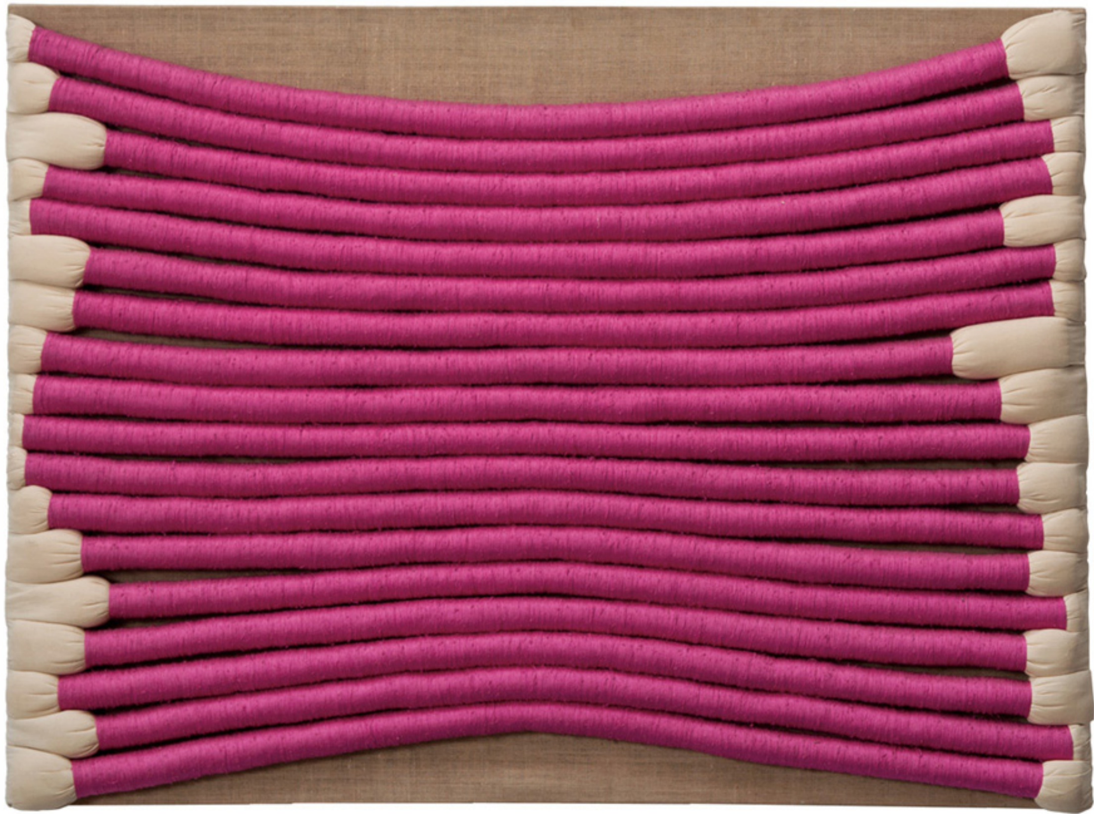
SHEILA HICKS Cord Structure , 1977 Coil-wrapped yarn on muslin backing 38.25 H x 51.33 inches 97.2 H x 130.4 cm