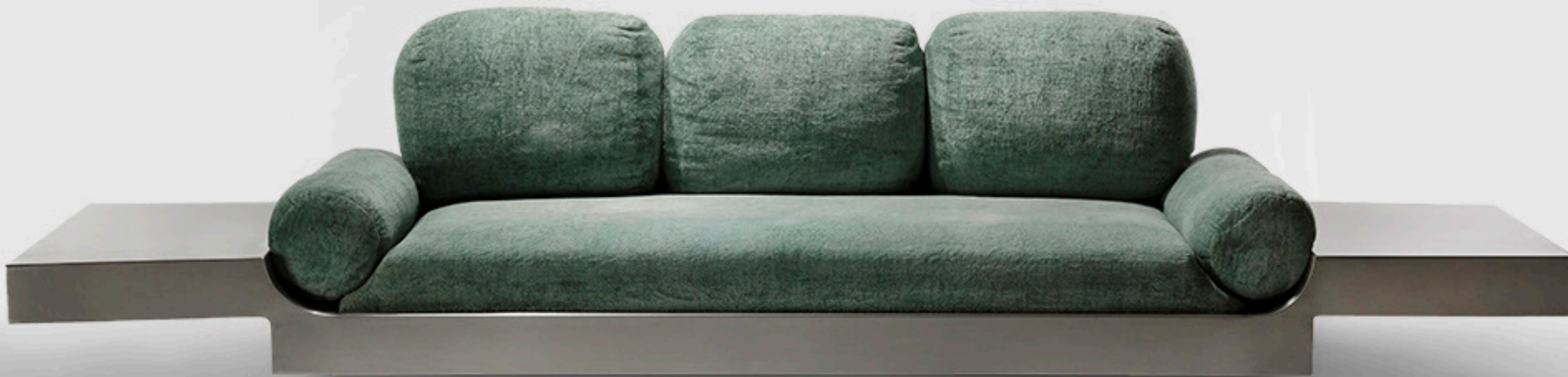
MARIA PERGAY Lit Banquette / Daybed , 1968 Stainless steel, upholstered cushions 10.5H x 118 x 33 inches 26.7H x 299.7 x 83.8 cm