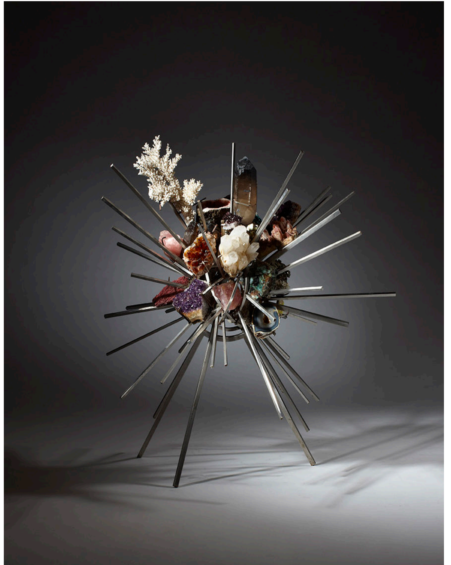
MARIA PERGAY Oursin / Sea Urchin , 1972 Stainless steel, collector's own rock specimens 53.15 x 47.24 inches 135 x 120 cm Commission for Baron Gourgaud