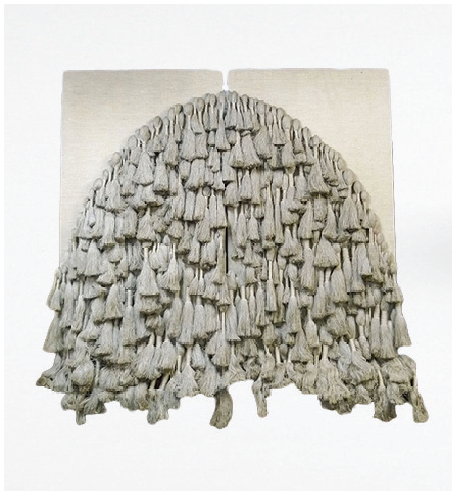
SHEILA HICKS Tapestry , c. 1970 Linen, cotton 74.8 x 74.8 inches 190 x 190 cm