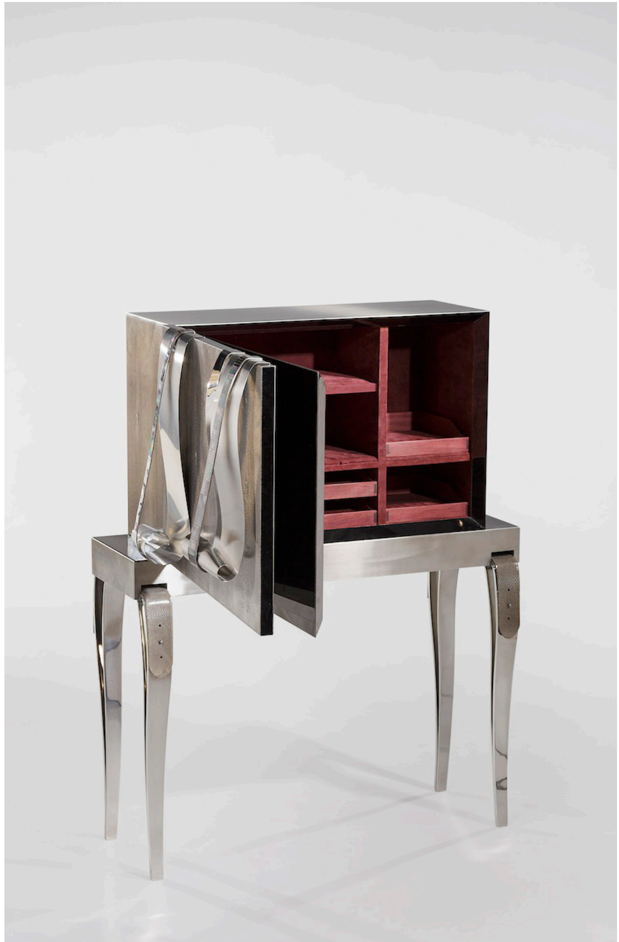
MARIA PERGAY Meuble Galuchat / Caviar Cabinet, 2005 Stainless steel, shagreen, black mother of pearl inlay 43.75 x 33.75 x 15.5 inches 111.1 x 85.7 x 39.4 cm Edition of 8