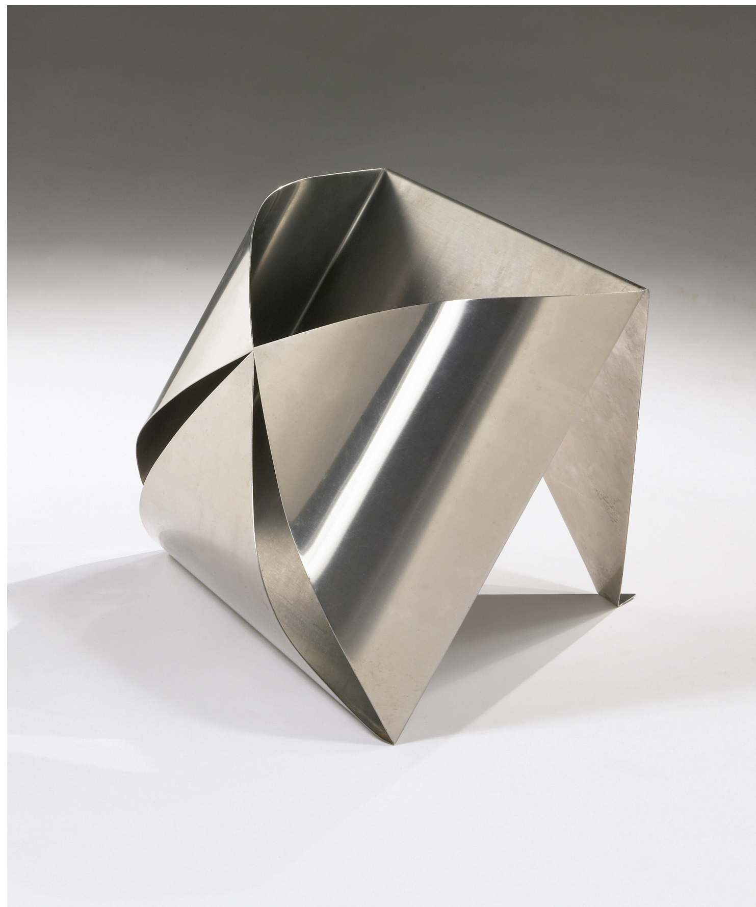
MARIA PERGAY Magazine Rack , 1970 c. Stainless steel 10.83H x 16.54 x 12.6 inches 27.5H x 42 x 32 cm