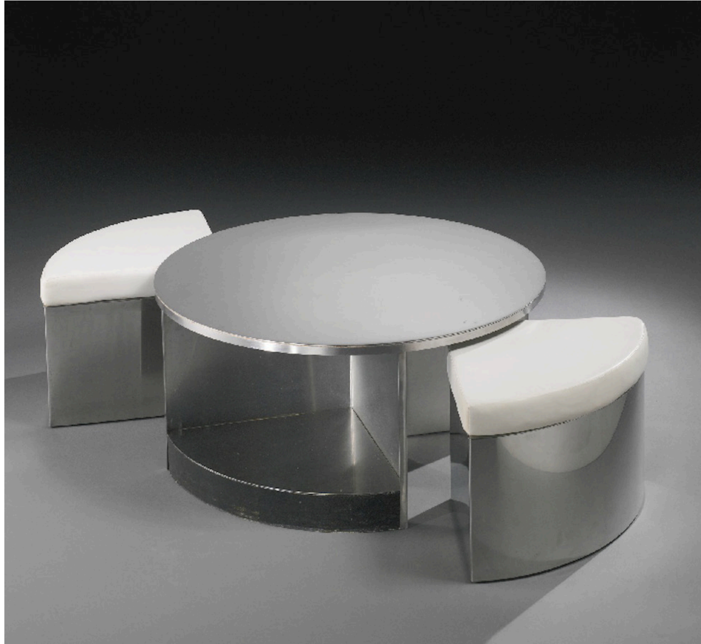
MARIA PERGAY Table Tambour Deux Sièges / Tambour Table with Two Seats, 1968 Stainless steel and lambskin 18.5 H x 39.5 Diameter inches 47 H x 100.3 Diameter cm