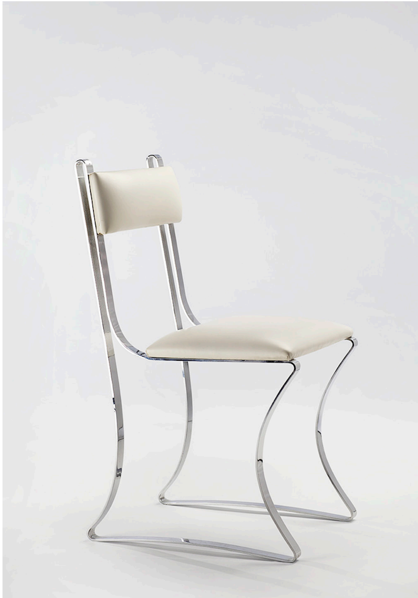
MARIA PERGAY Chaise X / X Chair , 1975 c. Stainless steel, leather 25.59 x 17.71 x 17.71 inches 65 x 45 x 45 cm Set of 4 available