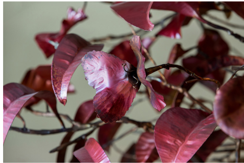
MARIA PERGAY Bronze Tree , 2013 Cast bronze, handmade patinated copper leaves 104.5 H x 82.5 inches 265.4 H x 209.6 cm Unique