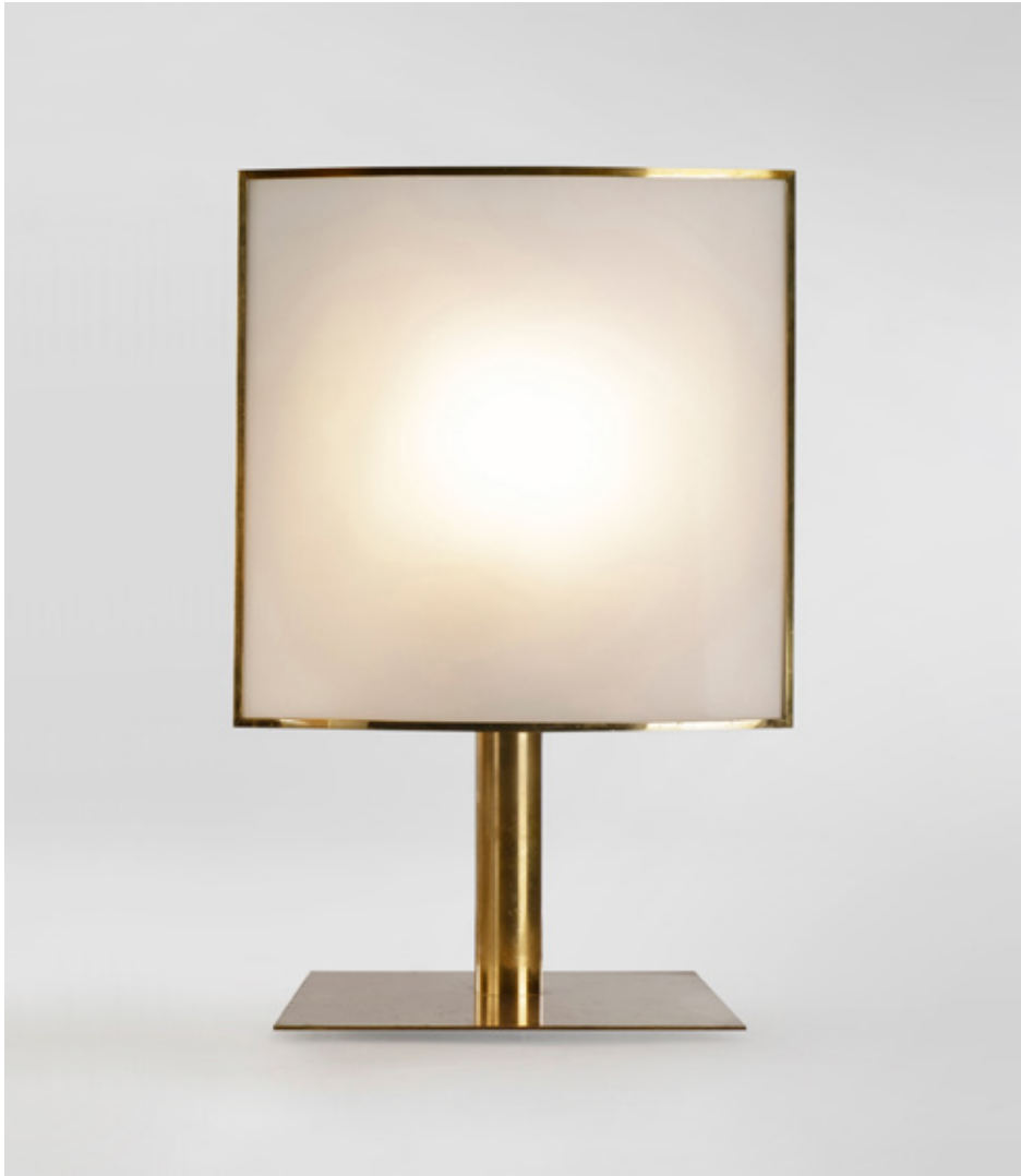
Michel Boyer Screen Lamp , 1975 Gilded brass, opaline glass 24.02 H x 15.75 x 11.81 inches 61 H x 40 x 30 cm Edition Verre Lumiere (MB3171)