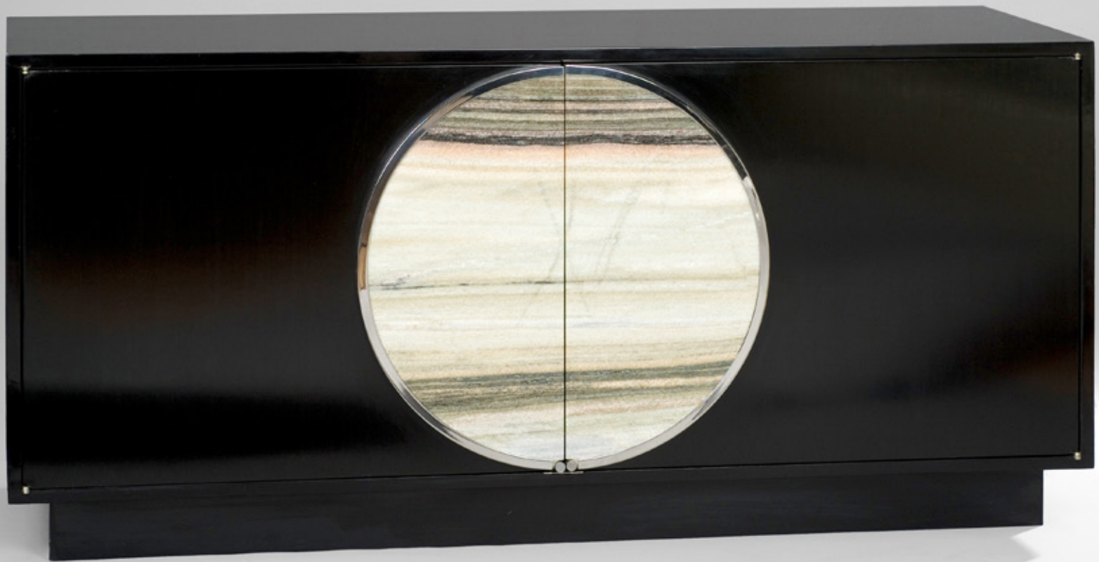
Maria Pergay Cabinet with Marble Disc , c. 1974 Black lacquered wood, marble 25.59 H x 62.99 x 23.62 inches 65 H x 160 x 60 cm (MP3228)