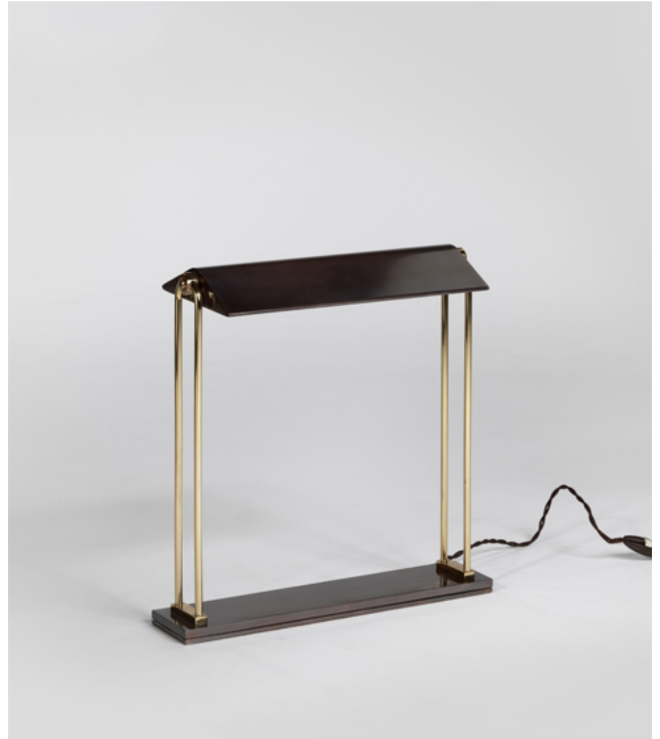
Jacques Grange Desk Lamp , 1978 Patinated steel, brass 15.16 H x 14.96 x 3.1 inches 38.5 H x 38 x 7.9 cm Edition Maison Meilleur (JG1674)