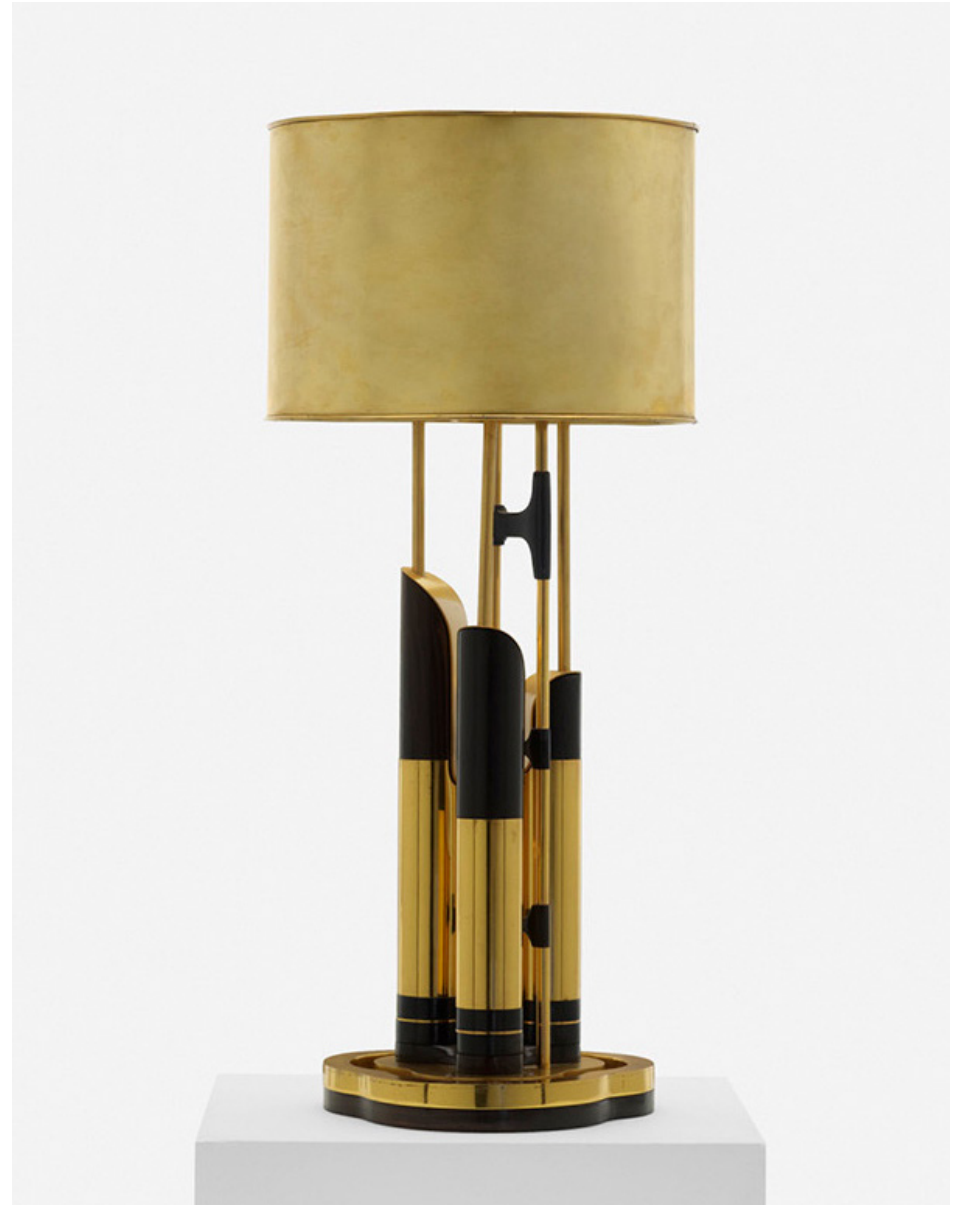
Claude de Muzac Table Lamp , c. 1970 Brass, rosewood, ebony 29.13 H x 9.45 x 9.45 inches 74 H x 24 x 24 cm Signed, base (Cd0008)