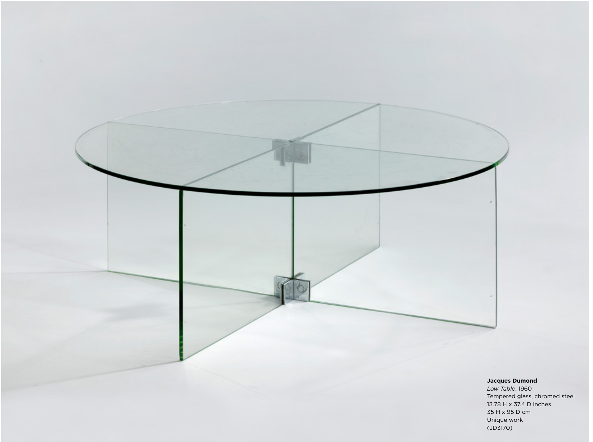
Jacques Dumond Low Table , 1960 Tempered glass, chromed steel 13.78 H x 37.4 D inches 35 H x 95 D cm Unique work (JD3170)