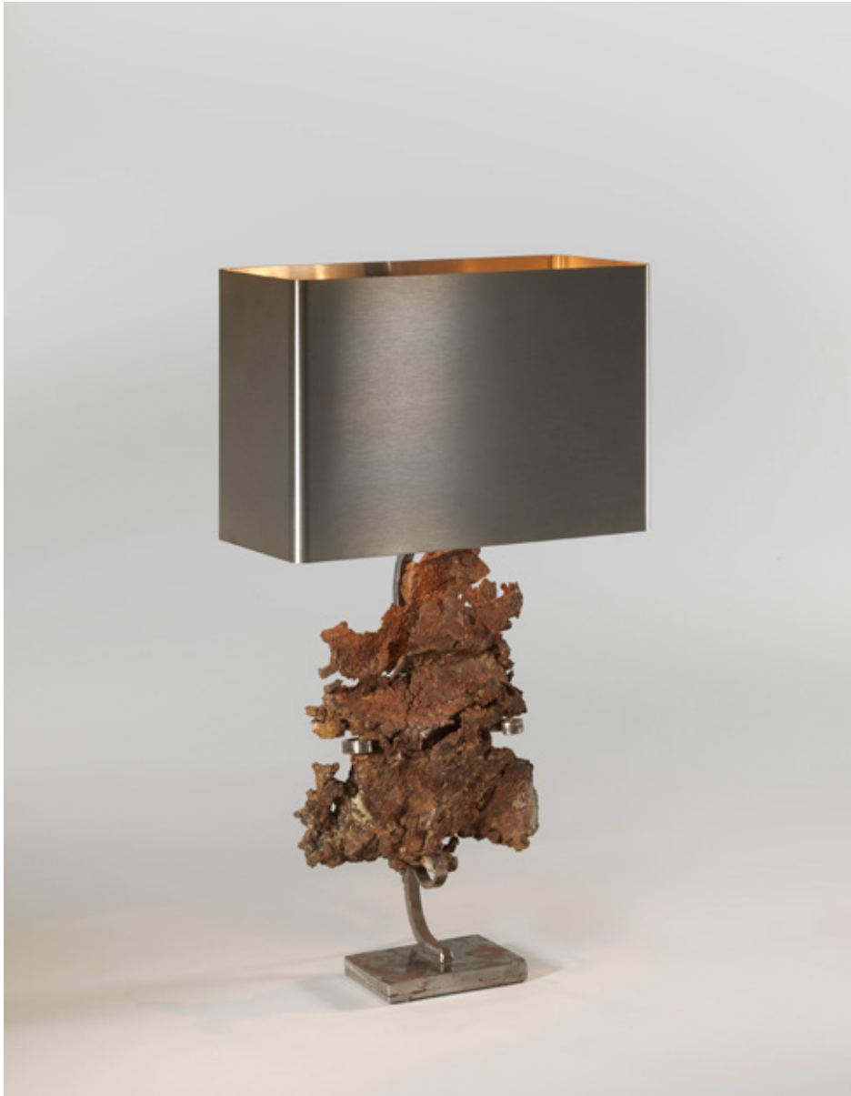
Claude de Muzac Lamp , 2005 Copper, stainless steel 22.05 H x 12.2 x 5.51 inches 56 H x 31 x 14 cm (CM0003)