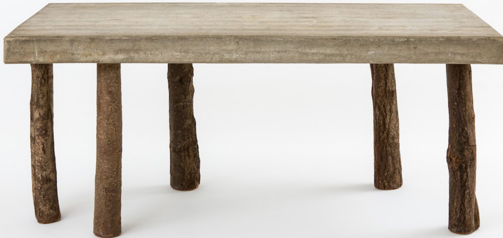
Jens Peter Schmid Concrete Table, 1986 Concrete, tree trunk 28.35 H x 70.87 x 35.43 inches 72 H x 180 x 90 cm (JS1635)