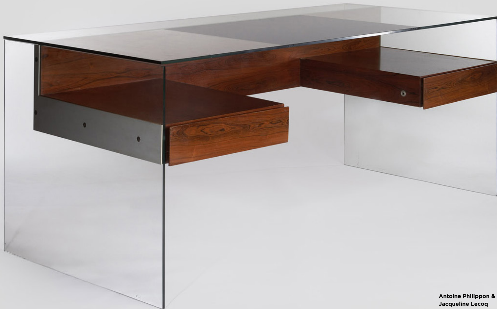
Antoine Philippon & Jacqueline Lecoq Desk , 1960 Glass, palissander 29.53 H x 62.99 x 31.5 inches 75 H x 160 x 80 cm Edition Jules Degorre (AP3140)