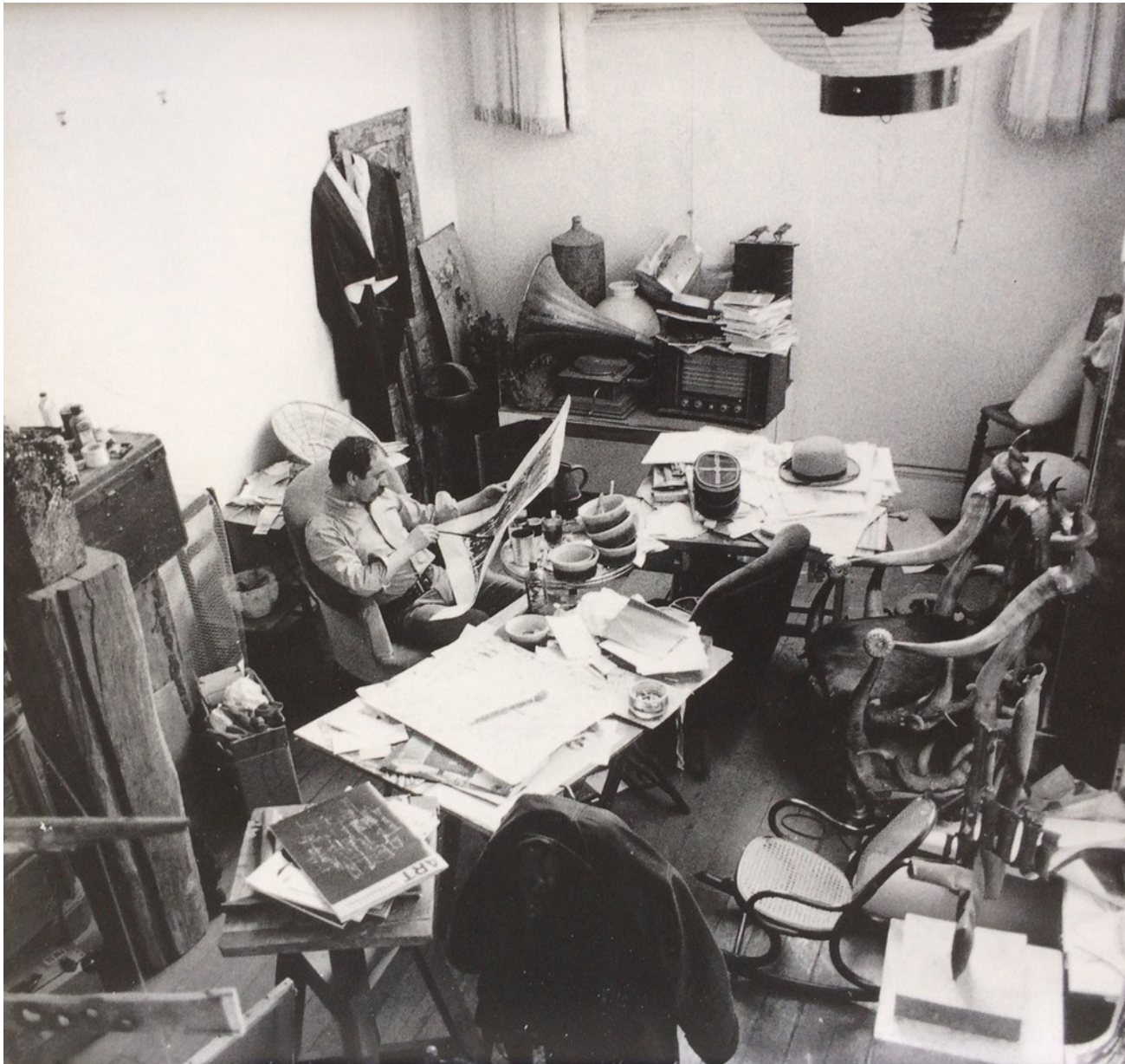
César drawing in his workshop, Paris, 1960s.