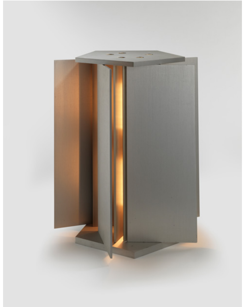
Kim Moltzer and Jean-Paul Barry Prismatic Lamp , 1968 Anodized aluminum 23.23 H x 9.06 x 9.06 inches 59 H x 23 x 23 cm Number E, distributed by Verre Lumiere (KM0069)