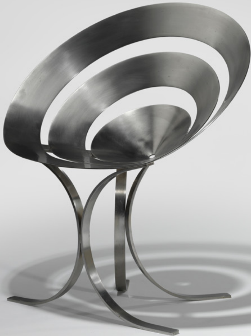
Maria Pergay Chaise Anneaux/Ring Chair, 1968 Stainless steel 33.46 H x 23.62 x 29.13 inches 85 H x 60 x 74 cm (MP3227)