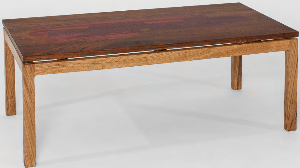
Michel Lefevre Low Table , c. 1960s Wood marquetry 15.75 H x 39.57 x 19.69 inches 40 H x 100.5 x 50 cm