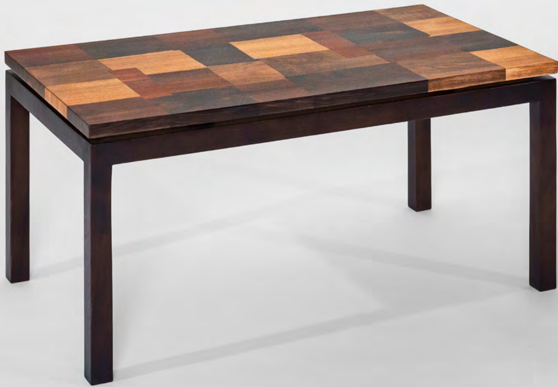
Michel Lefevre Low Table , 1965 Wood marquetry 16.93 H x 35.43 x 19.69 inches 43 H x 90 x 50 cm