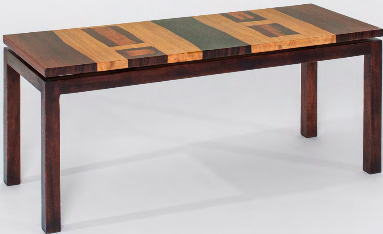
Michel Lefevre Low Table , 1970 Wood marquetry 16.93 H x 37.4 x 14.96 inches 43 H x 95 x 38 cm