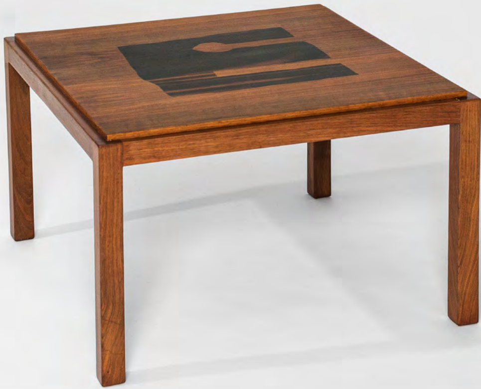
Michel Lefevre Low Table , 1963 Wood marquetry 14.17 H x 22.83 x 22.83 inches 36 H x 58 x 58 cm