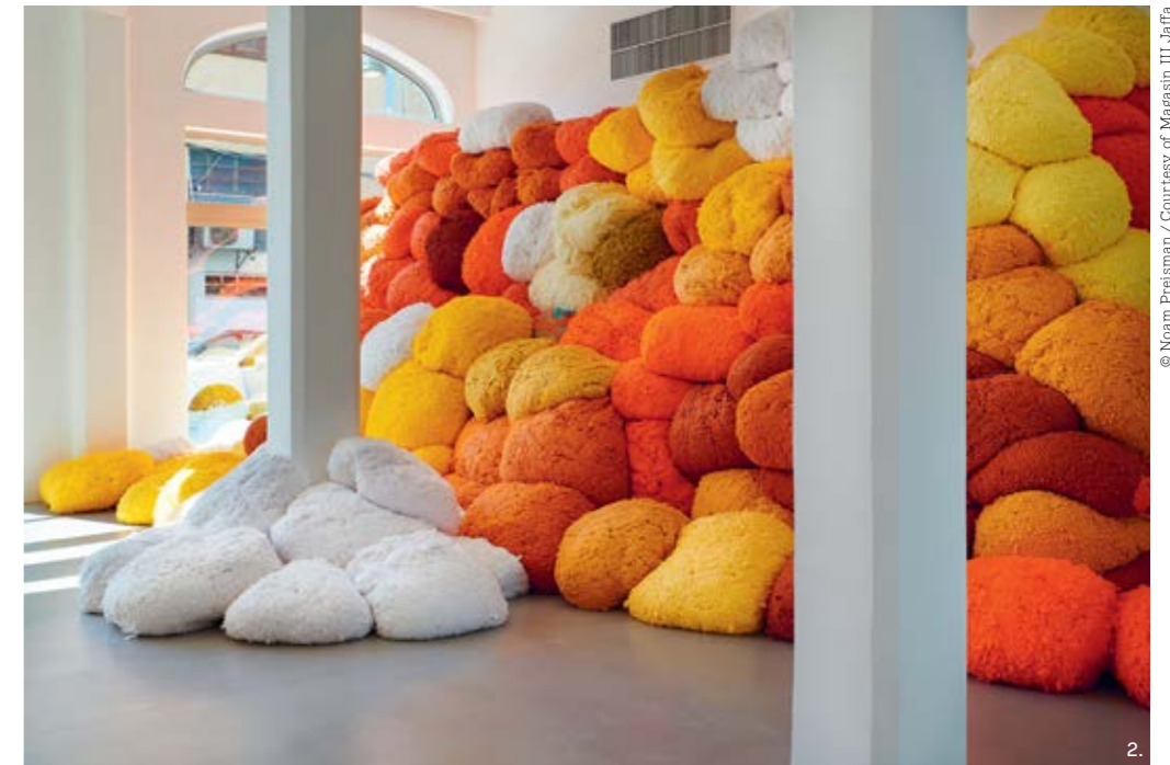
1 — Sheila Hicks 2 — Migdalor , installation, Magasin III, Jaffa, 2018