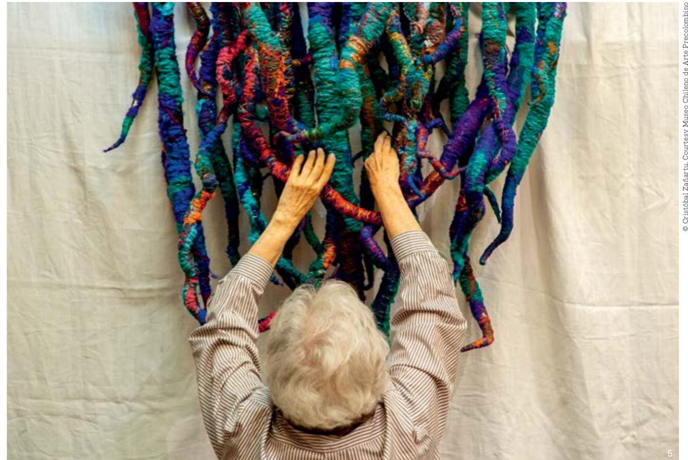
© Cristóbal Zañartu, Courtesy Museo Chileno de Arte Precolombino